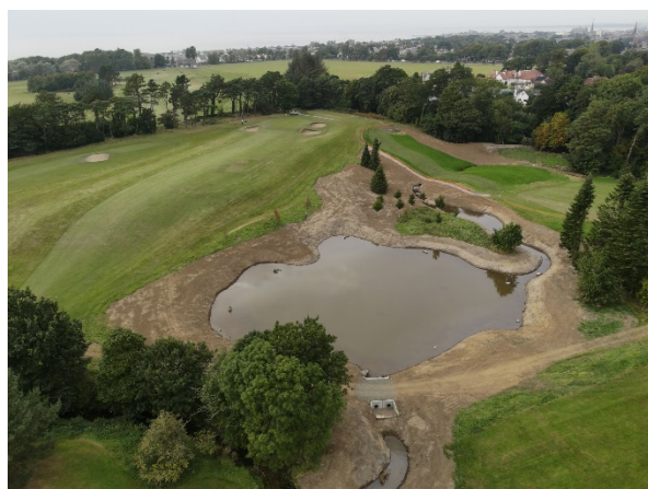
Seafeld Nature Restoration Pond