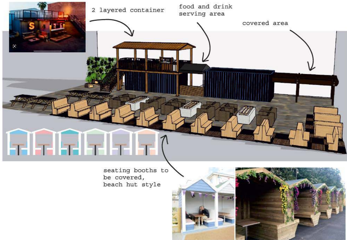
Photograph 1 – Showing the proposed structures and layout of the site