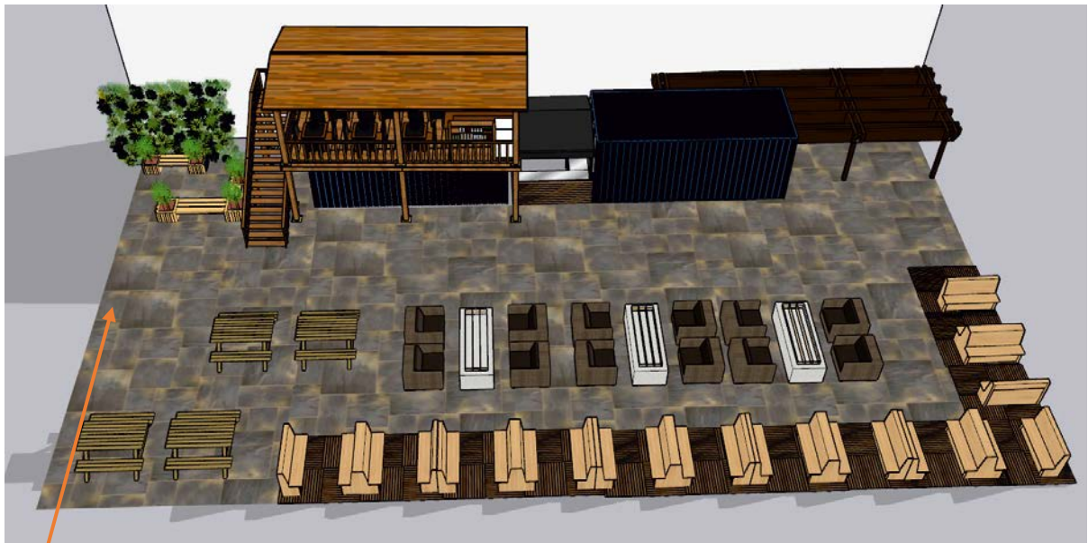
Photograph 3 – Aerial view of site with arrow indicating the location of entrance gate