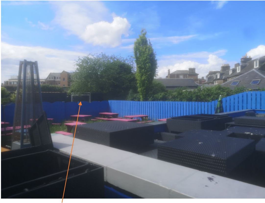
Screen visible from next door premises garden