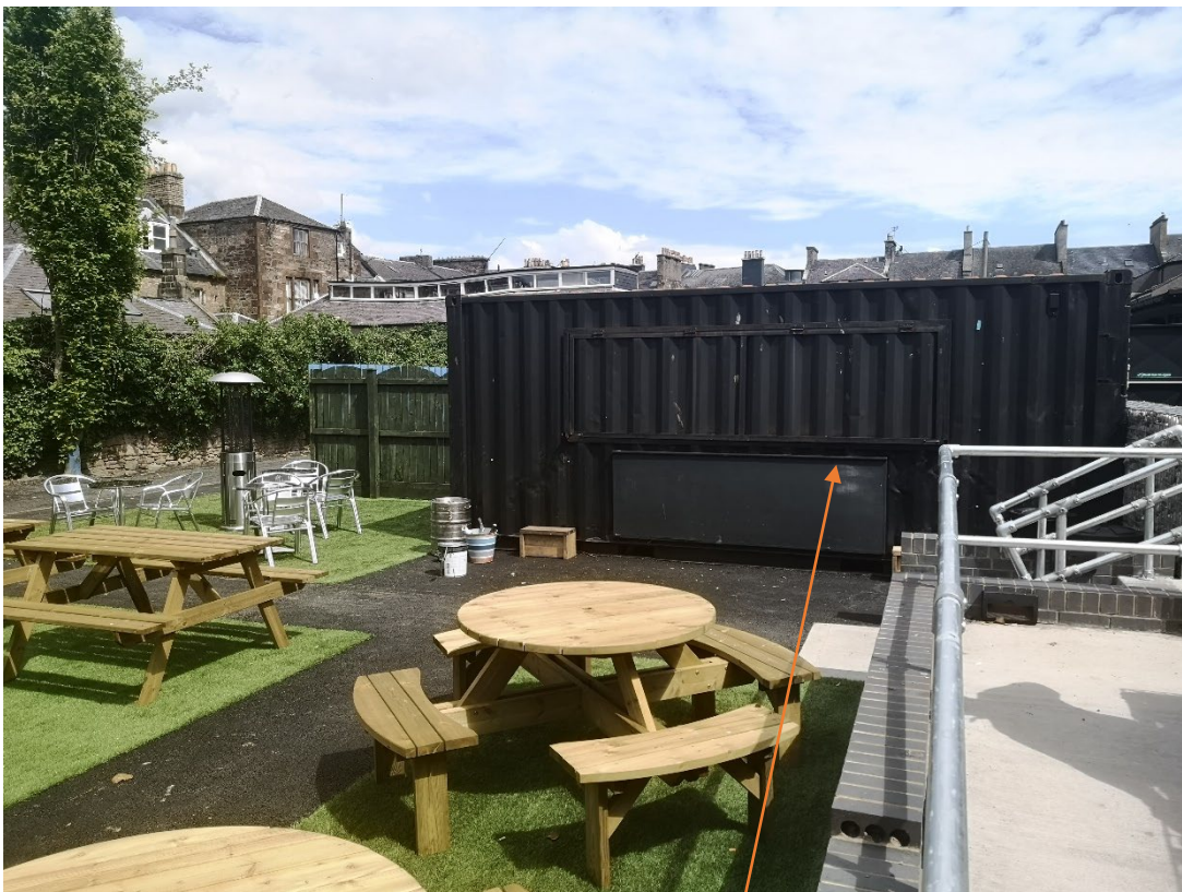
External Bar unit