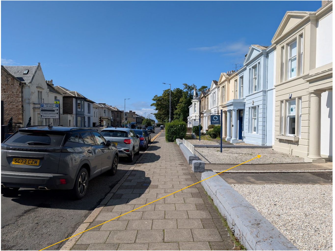
Photograph shows street view and location of application site