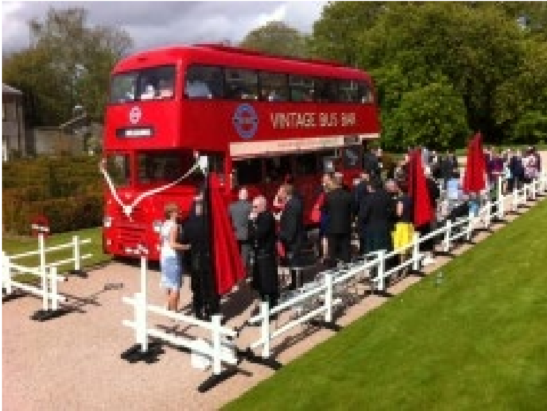
Photograph above shows 'The Vintage Bus' at an event