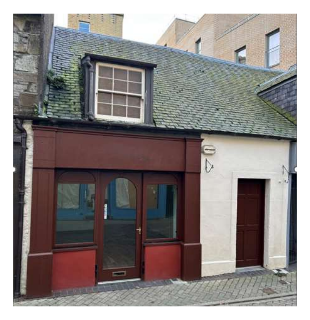
TO LET 21 CARRICK STREET, AYR

South Ayrshire Council County Buildings Wellington Square Ayr KA7 1DR