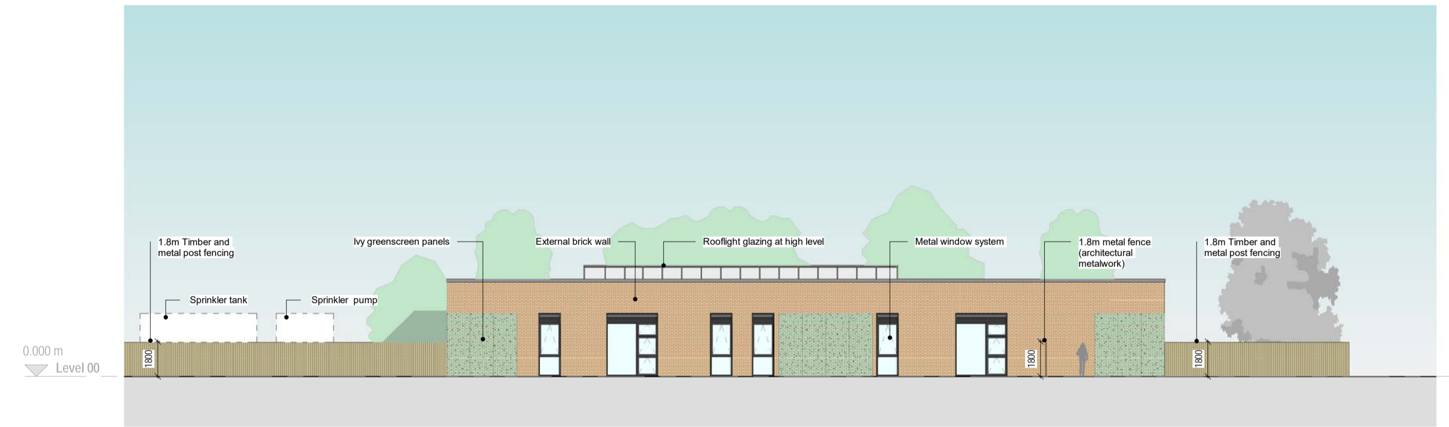
Proposed Early Years Centre Elevation - North