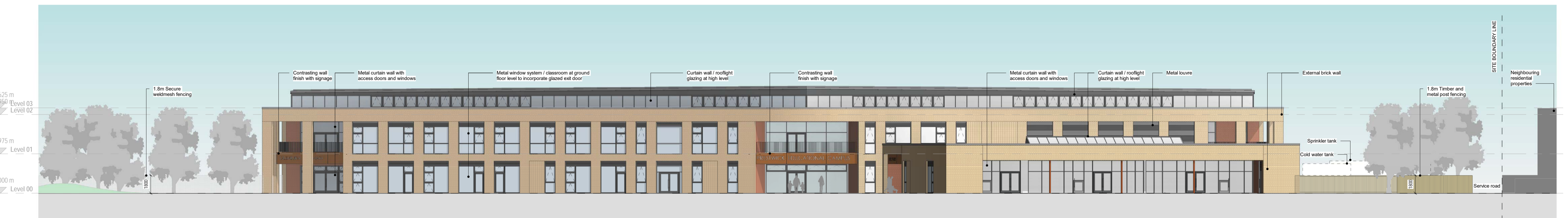
Proposed Prestwick Educational Campus - Sherwood Rd View - NB: Context to the front not shown for clarity

BUILDING DESIGN PARTNERSHIP SHALL HAVE NO RESPONSIBILITY FOR ANY USE MADE OF THIS DOCUMENT OTHER THAN FOR THAT WHICH IT WAS PREPARED AND ISSUED. ALL DIMENSIONS SHOULD BE CHECKED ON SITE. DO NOT SCALE FROM THIS DRAWING. ANY DRAWING ERRORS OR DIVERGENCIES SHOULD BE BROUGHT TO THE ATTENTION OF BUILDING DESIGN PARTNERSHIP AT THE ADDRESS SHOWN BELOW. DRAWINGS SHALL BE READ IN CONJUNCTION WITH THE FOLLOWING: - THE BDP CDM RISK SCHEDULE - THE BDP RISK SERIES OF DRAWINGS (IF APPLICABLE)