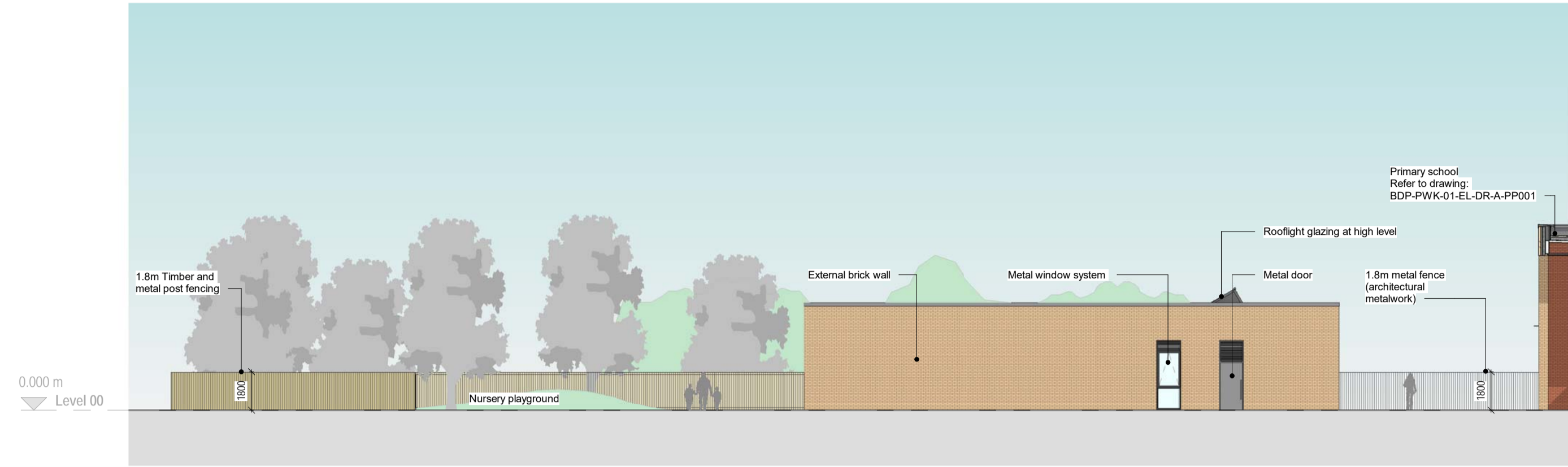
Proposed Early Years Centre Elevation - East