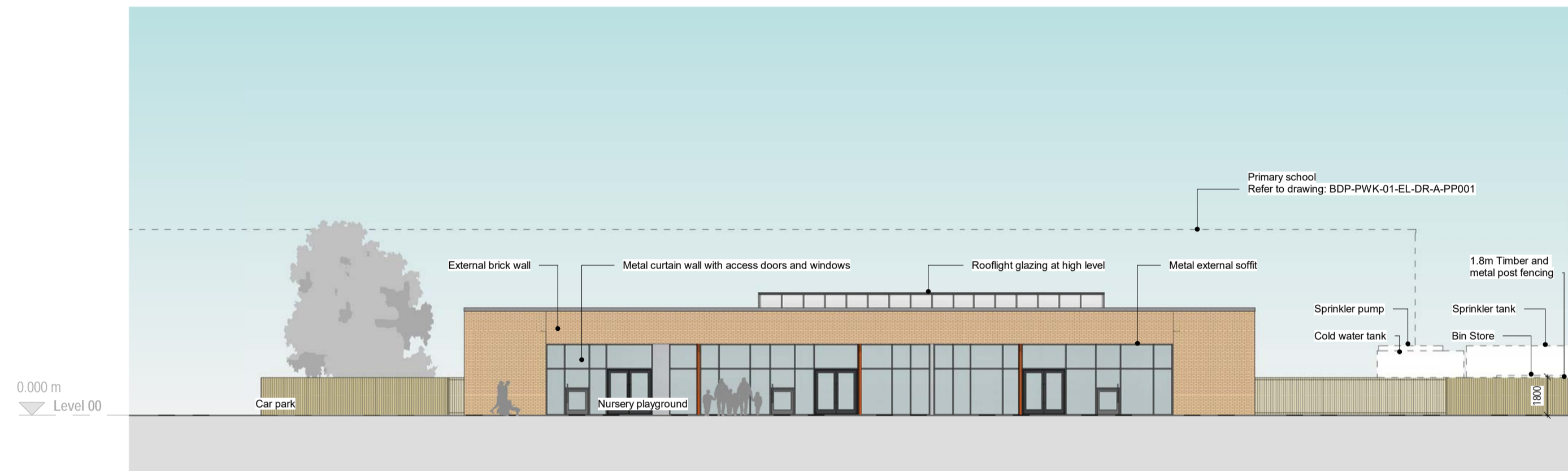
Proposed Early Years Centre Elevation - South