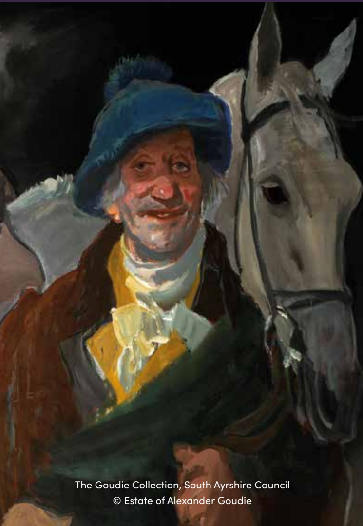
The Goudie Collection, South Ayrshire Council © Estate of Alexander Goudie

Enjoy two self-guided historical walking trails led by 23 Blue Bonnet signs over 31 locations from Ayr town centre out to Alloway, exploring the streets and parks along the way. Download the app “Ayr Through The Ages” and find the Blue Bonnet Trails in “Historical Tours” to experience fully.