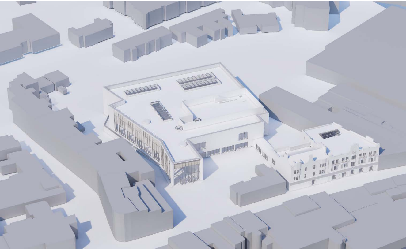
Aerial View from Dalblair Road