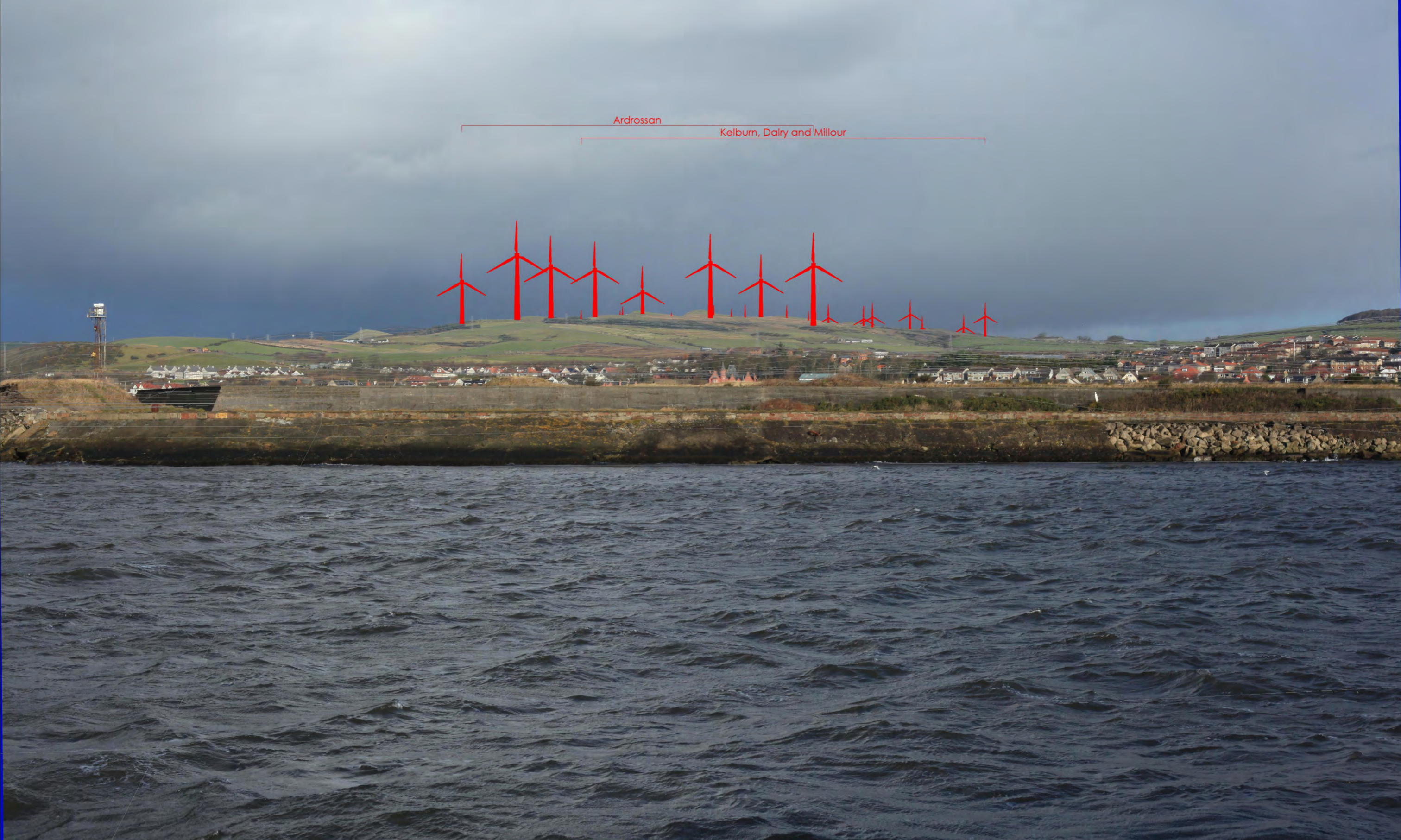
Increased turbine heights to 200m