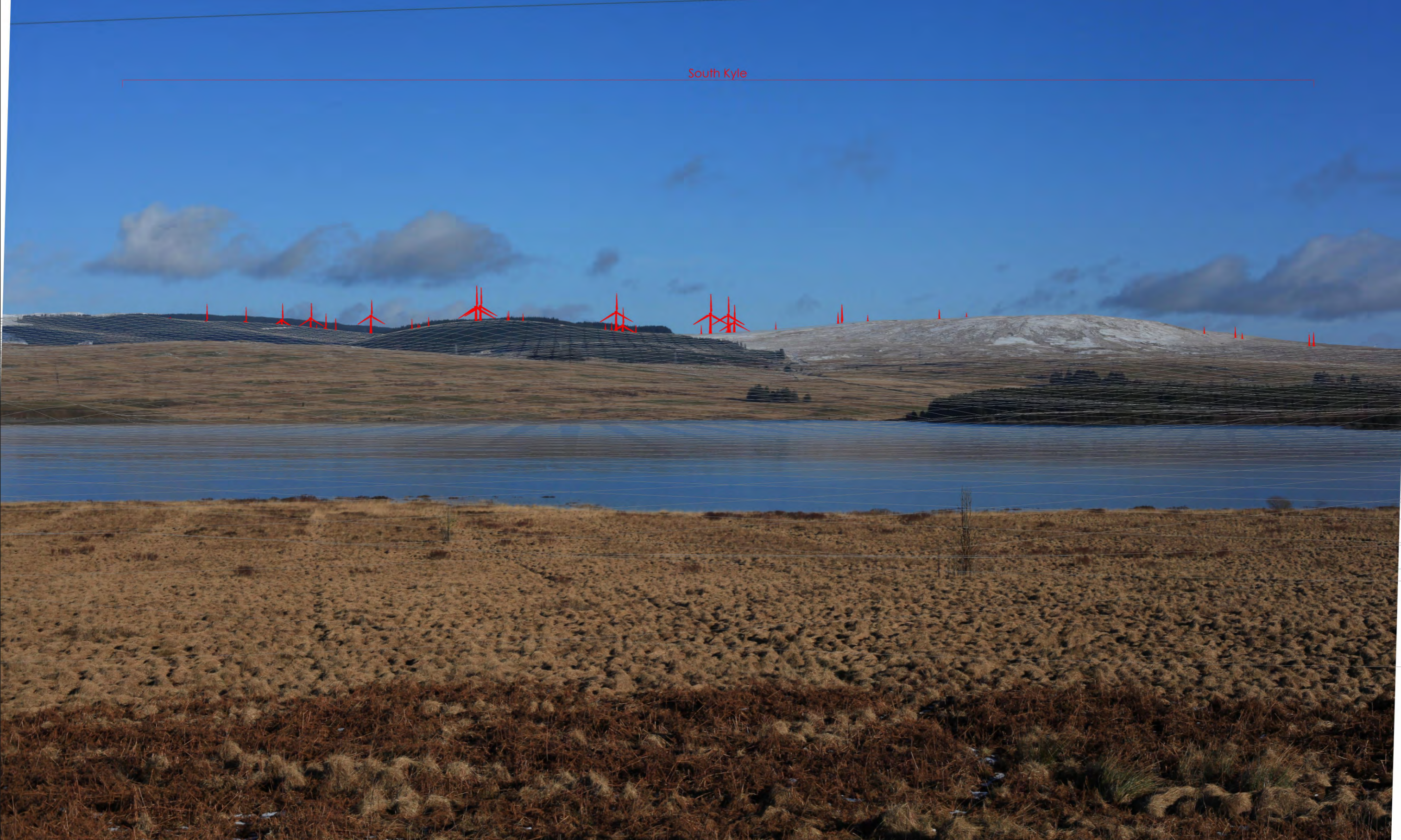
Increased turbine heights to 200m