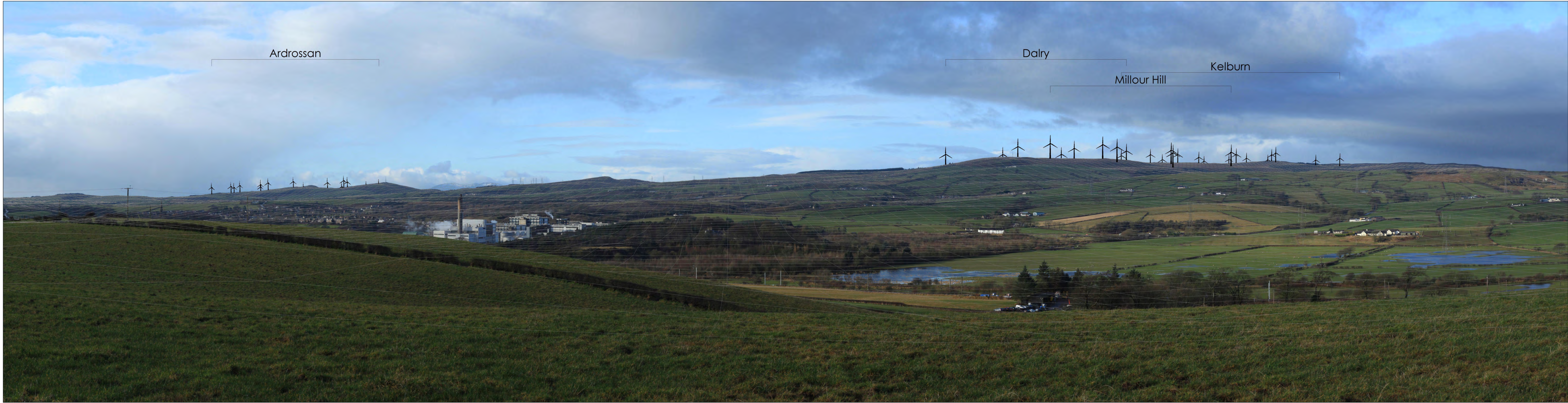
Original operational and consented turbine heights