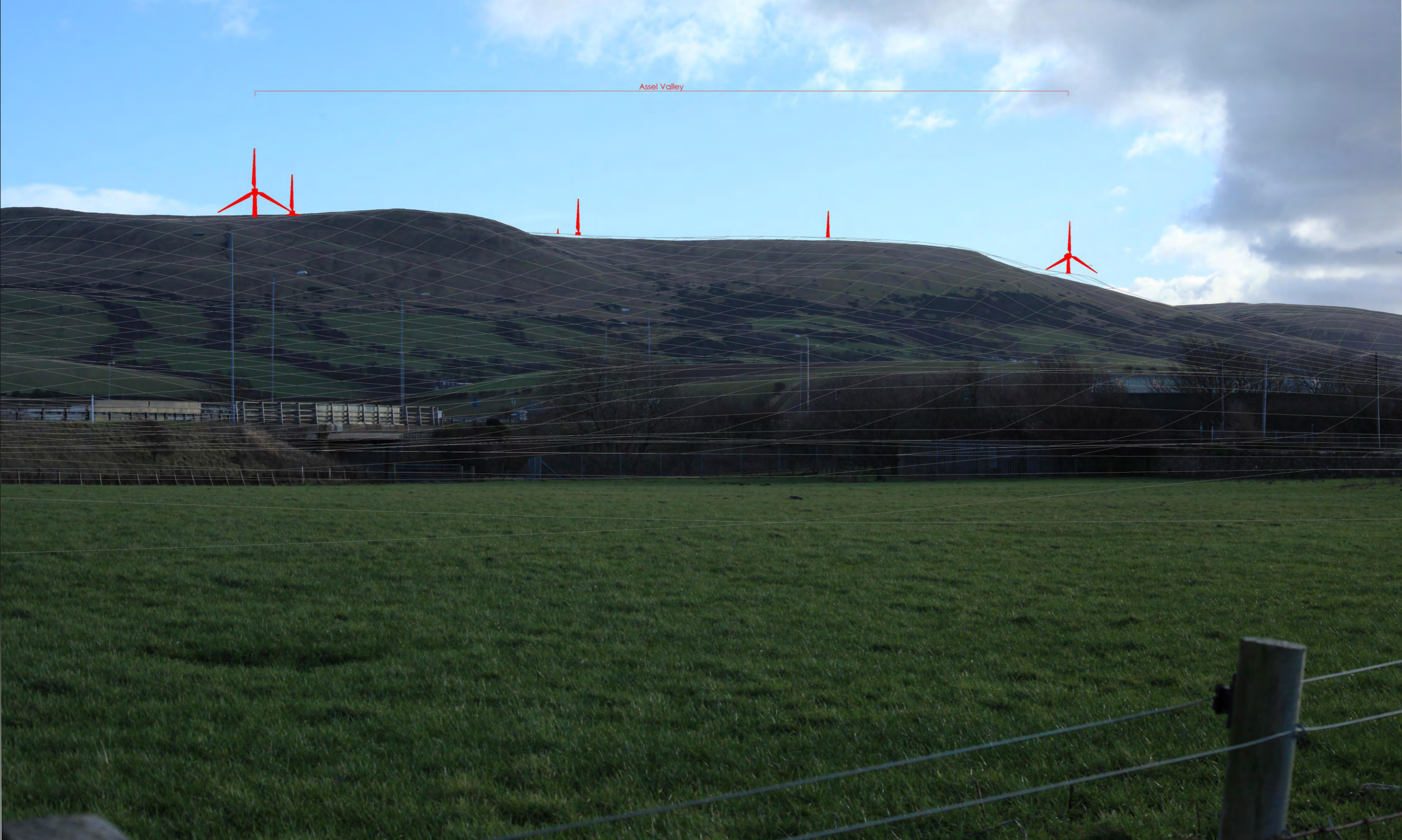
Increased turbine heights to 200m