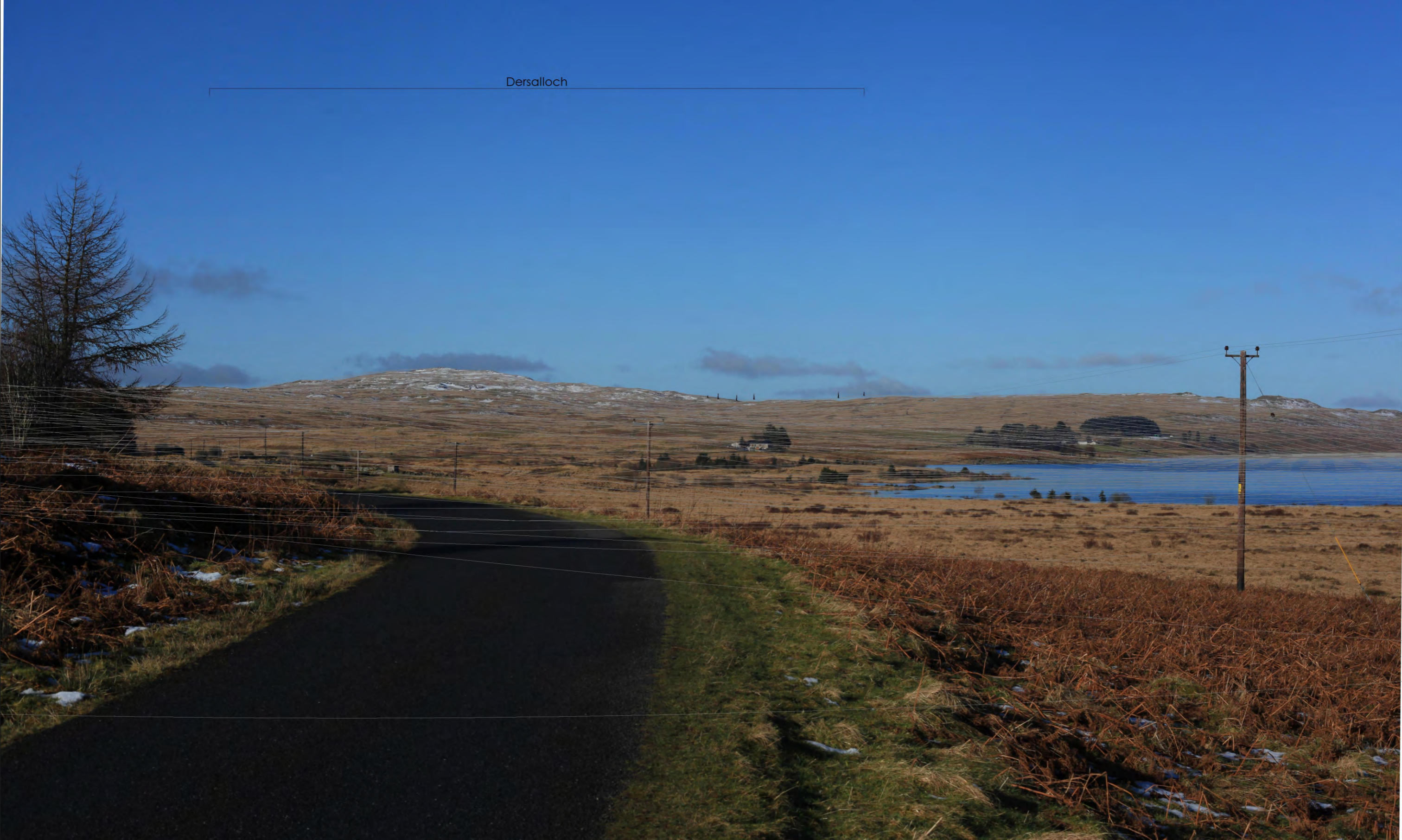
Original operational and consented turbine heights