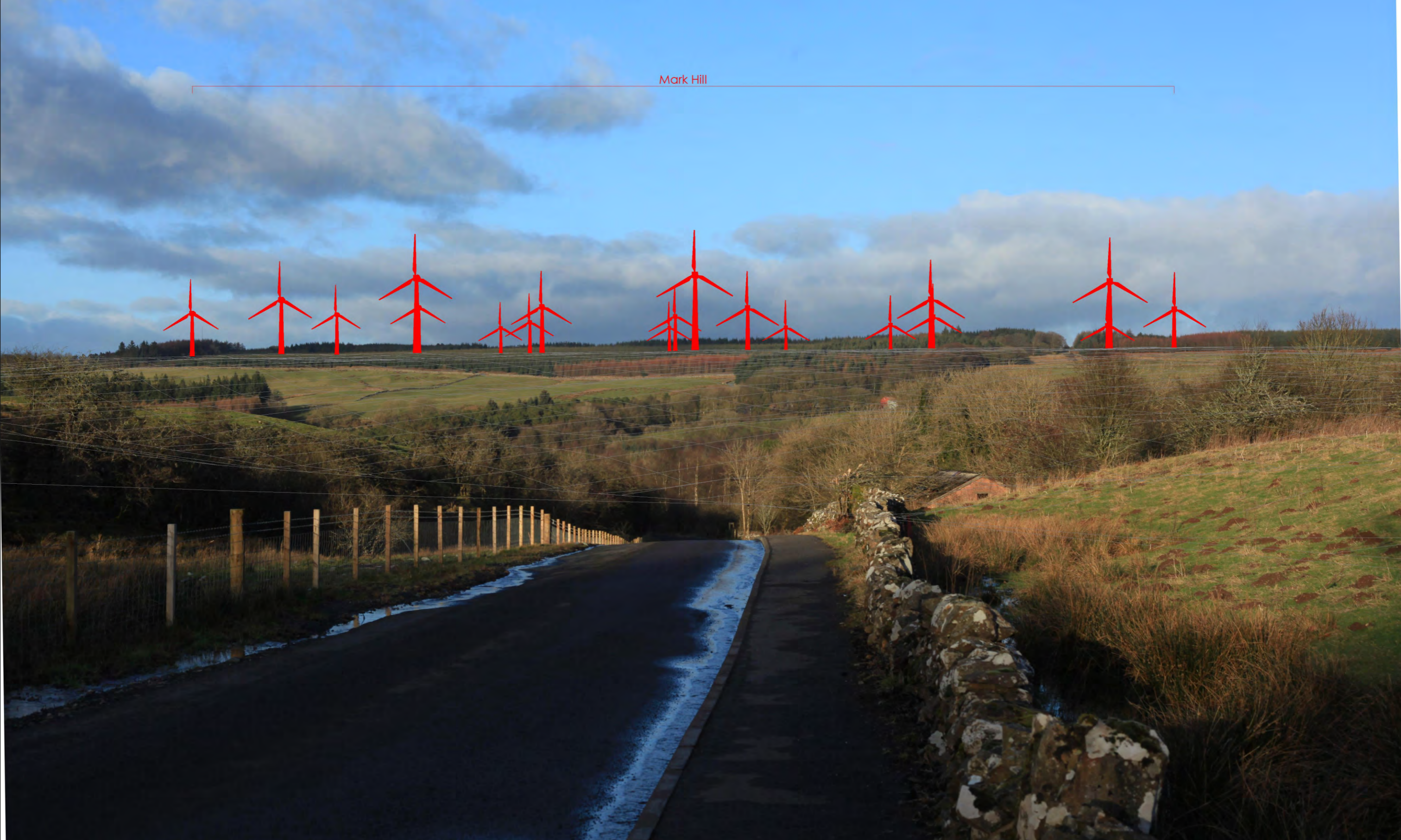
Increased turbine heights to 200m