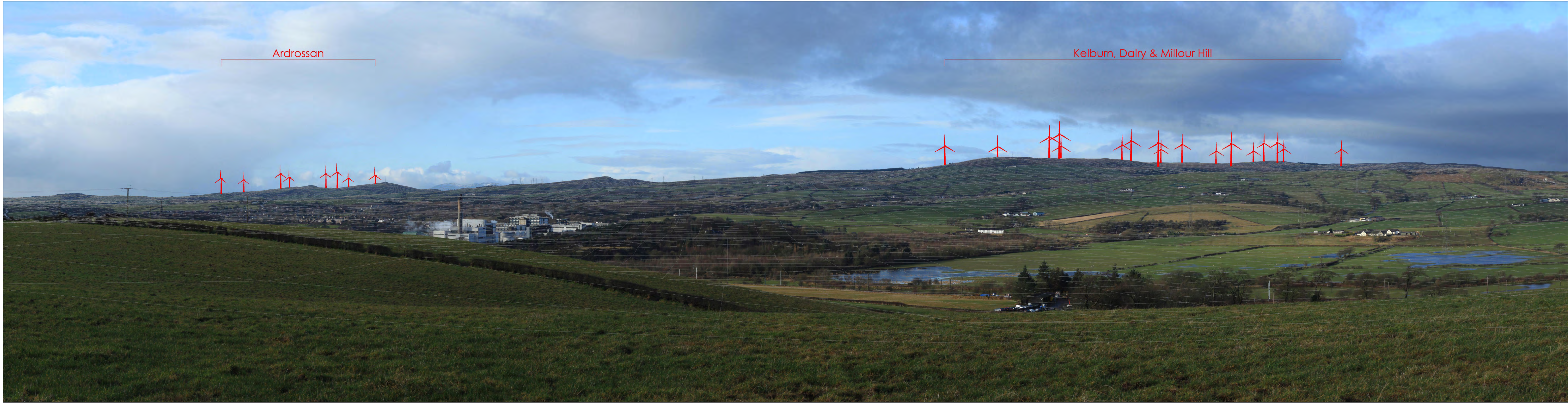
Increased turbine heights to 200m