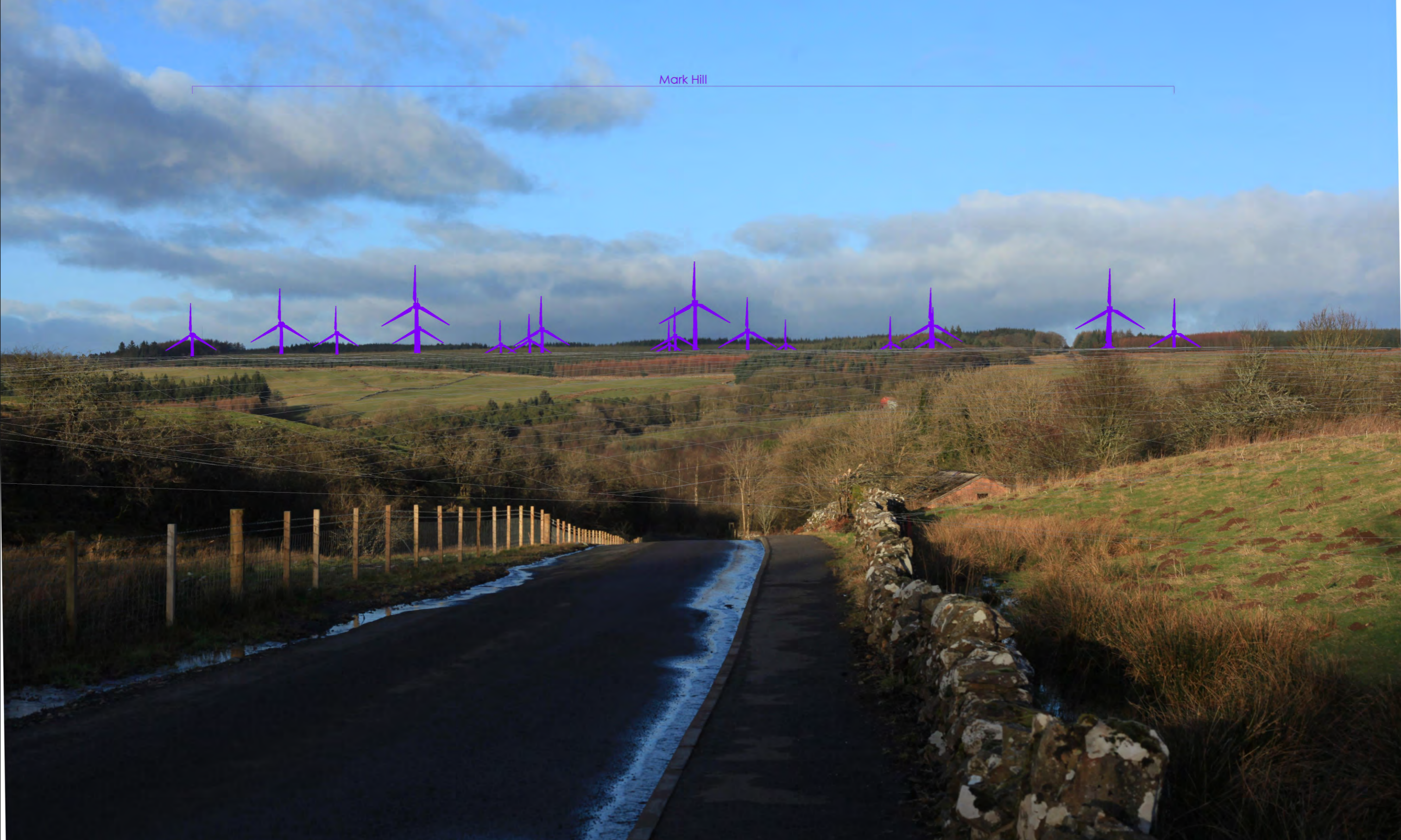
Increased turbine heights to 150m