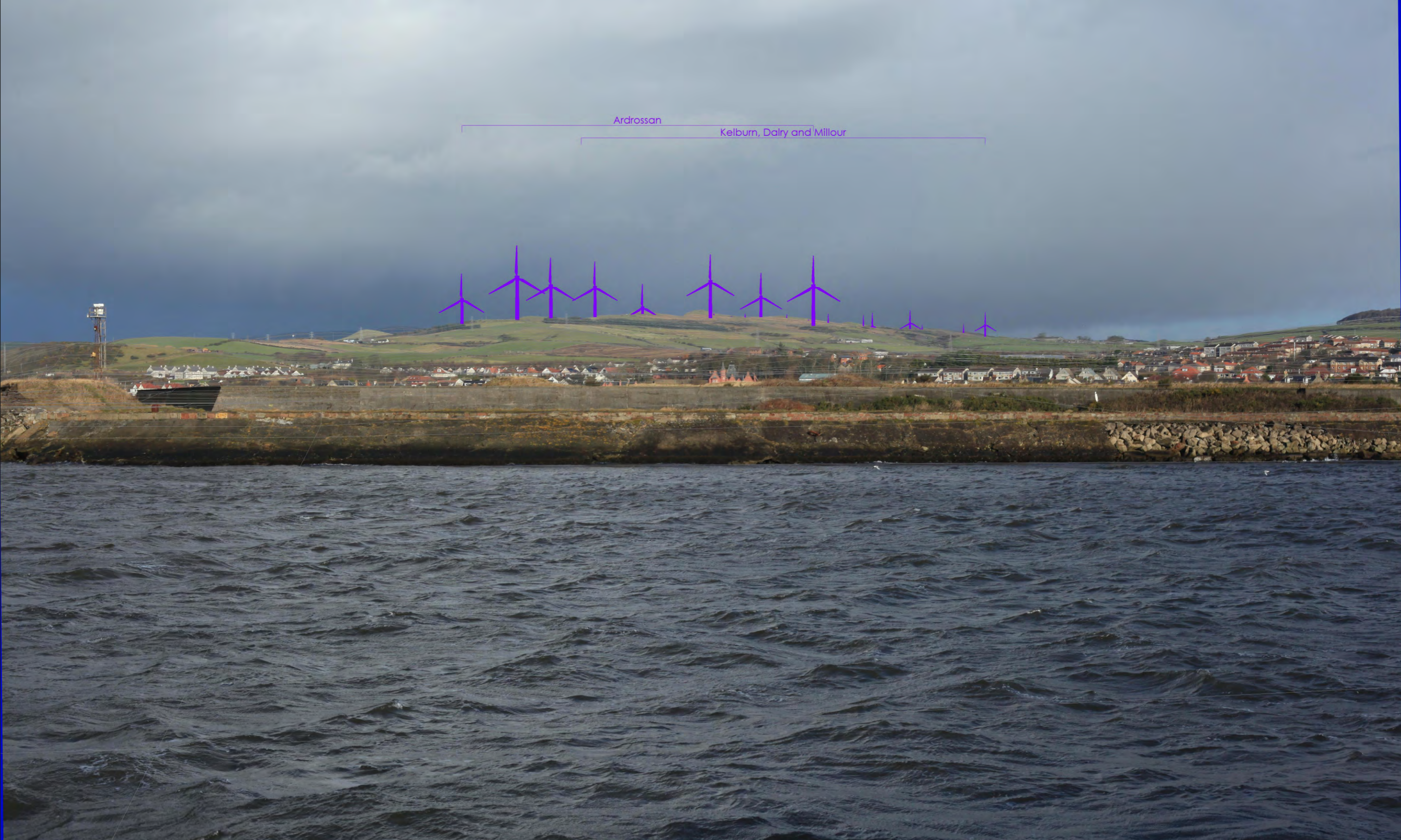
Increased turbine heights to 150m