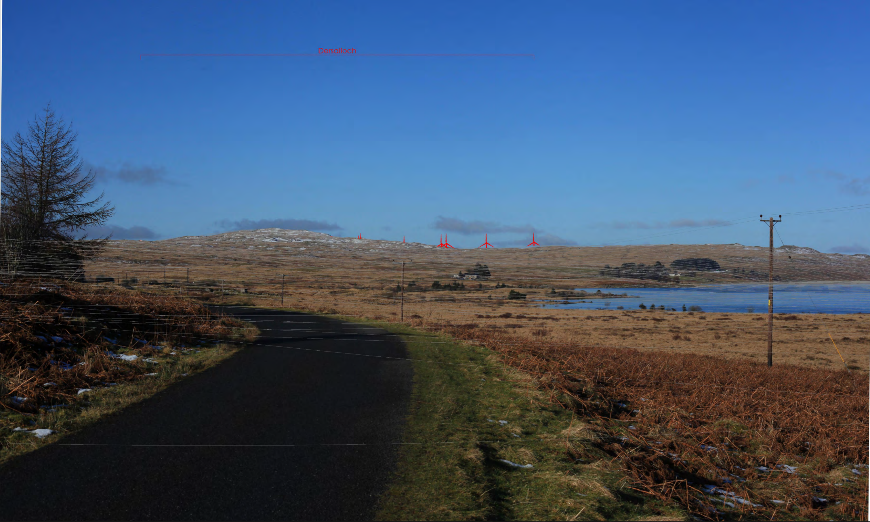
Increased turbine heights to 200m