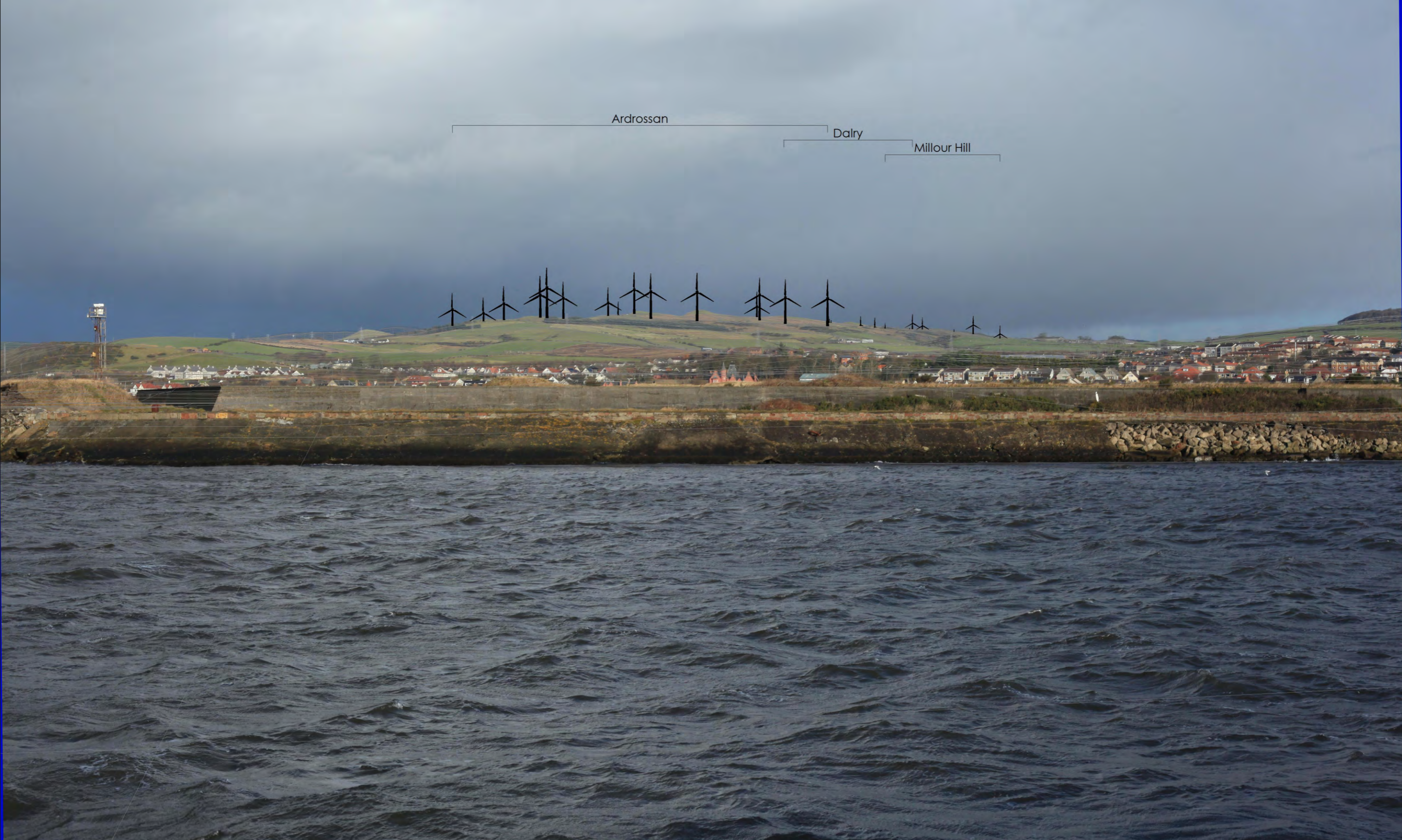
Original operational and consented turbine heights