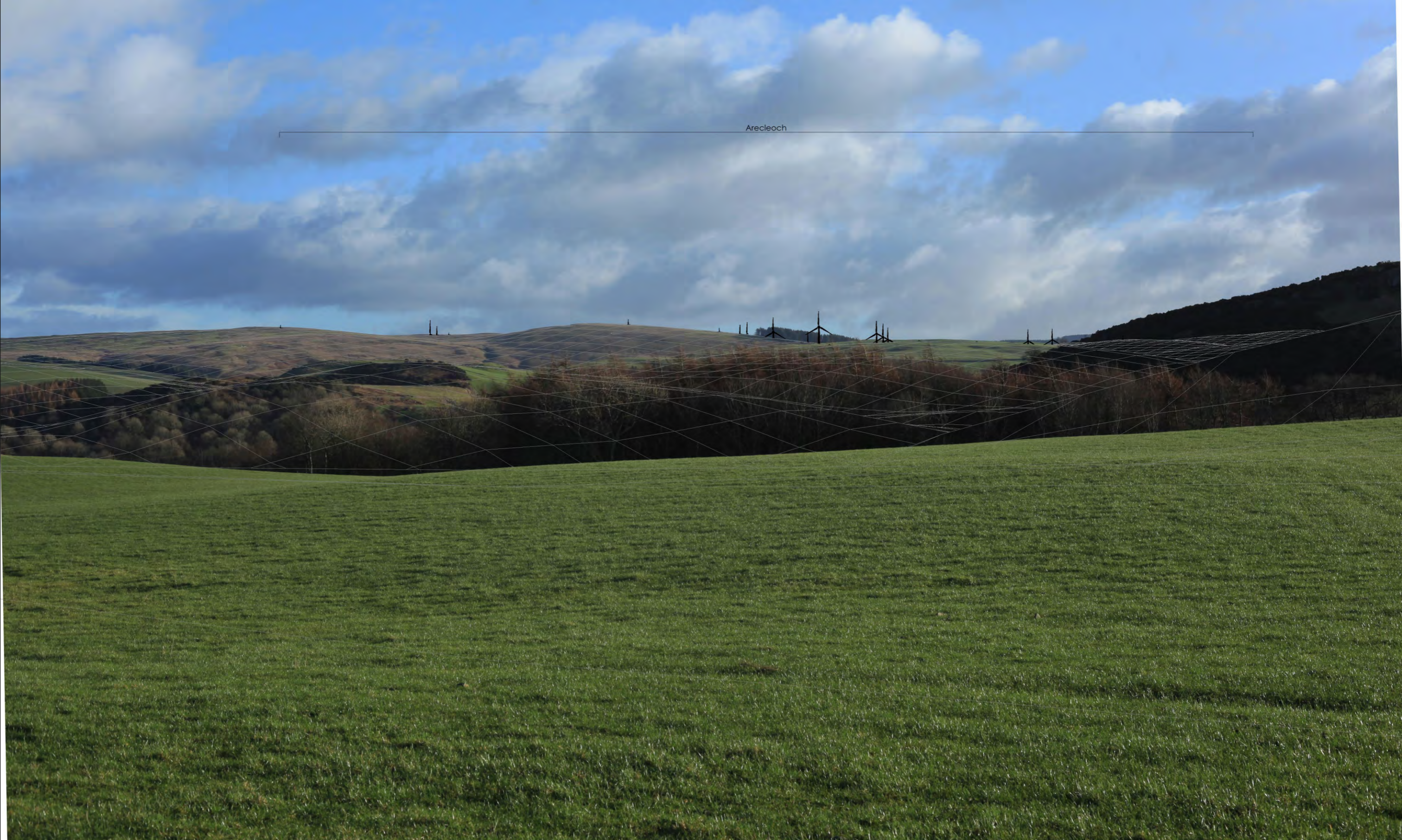
Original operational and consented turbine heights