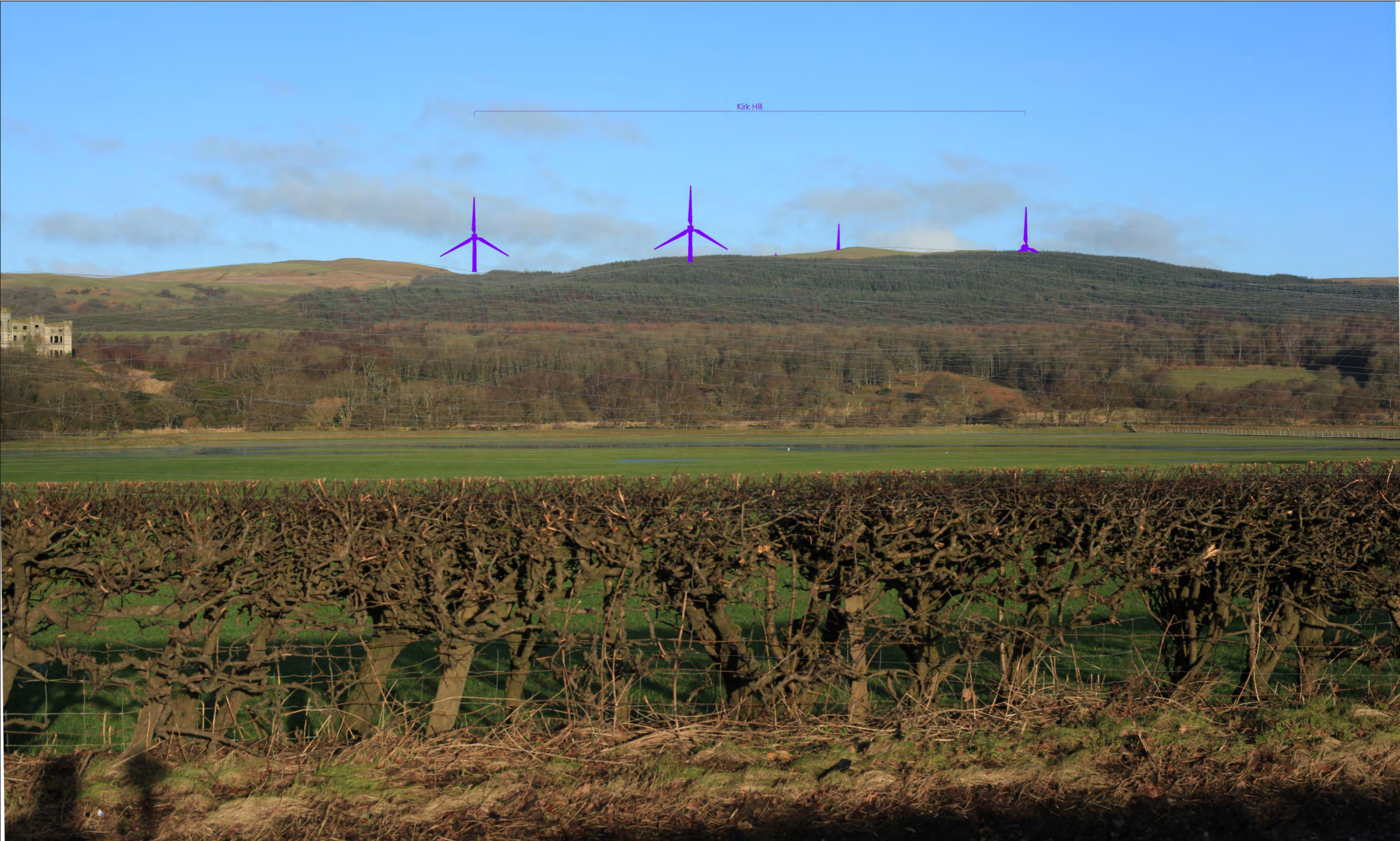
Increased turbine heights to 150m