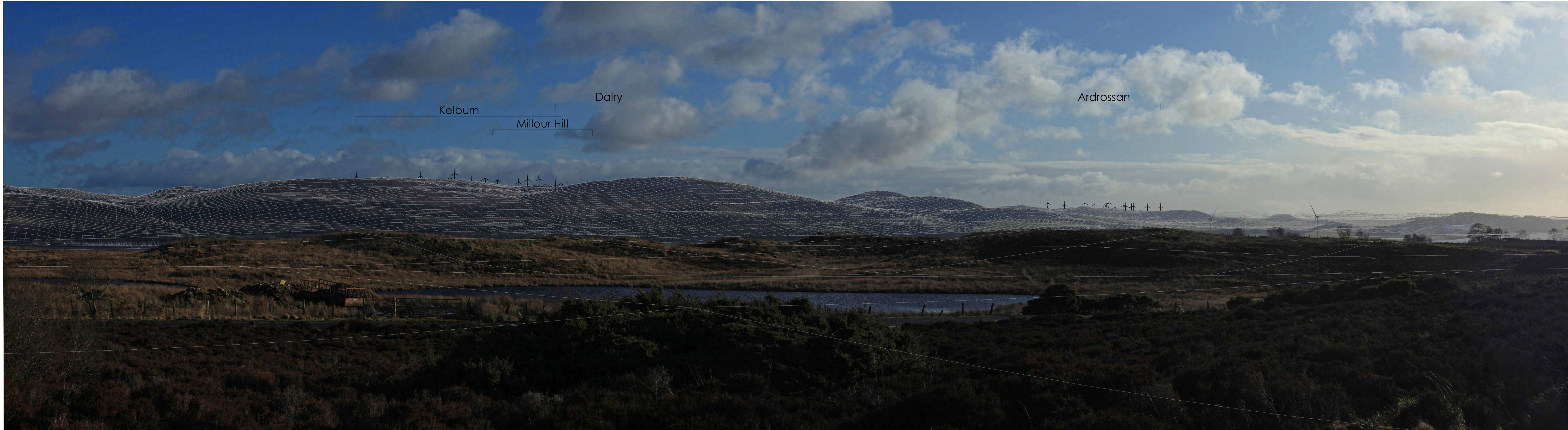
Original operational and consented turbine heights