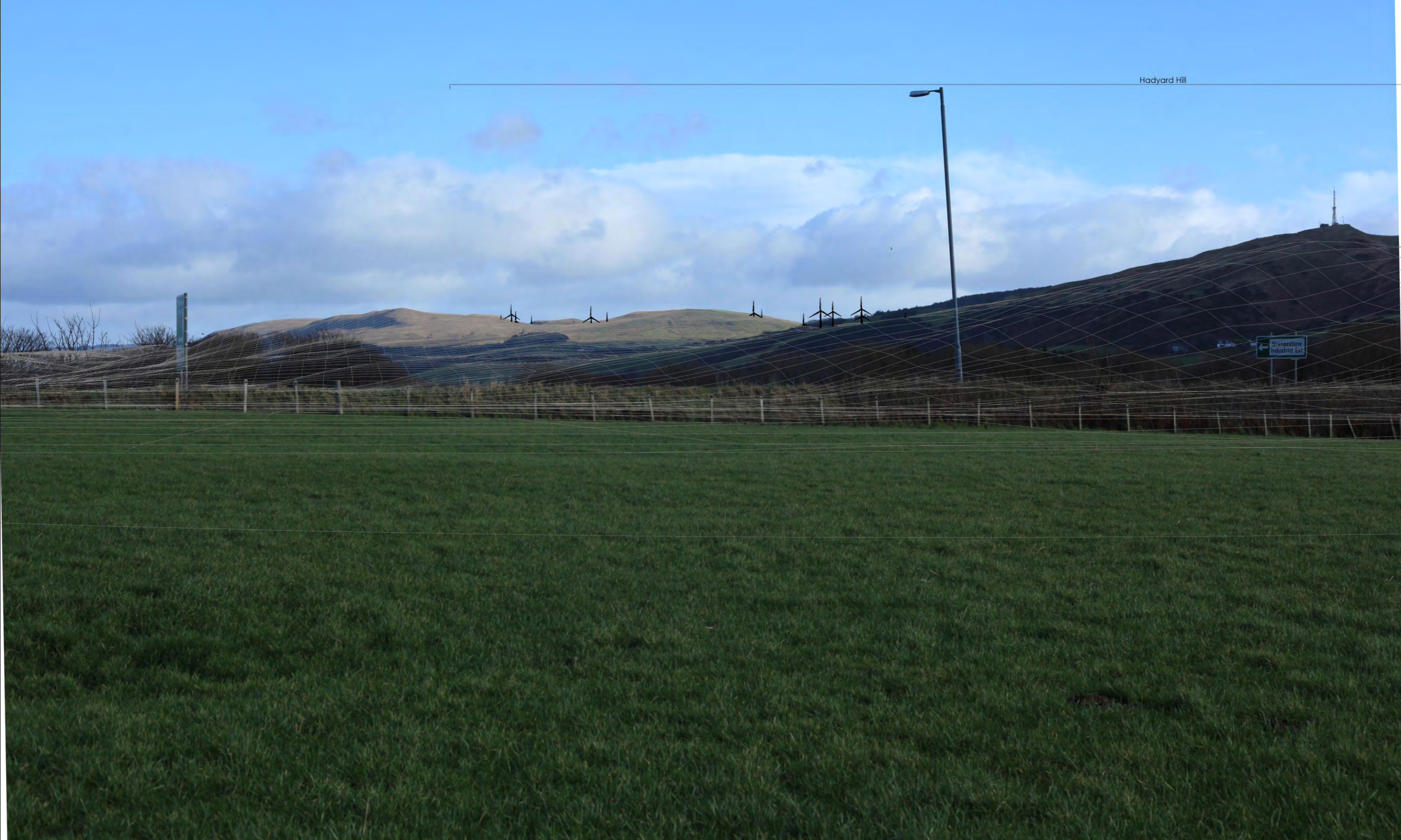
Original operational and consented turbine heights