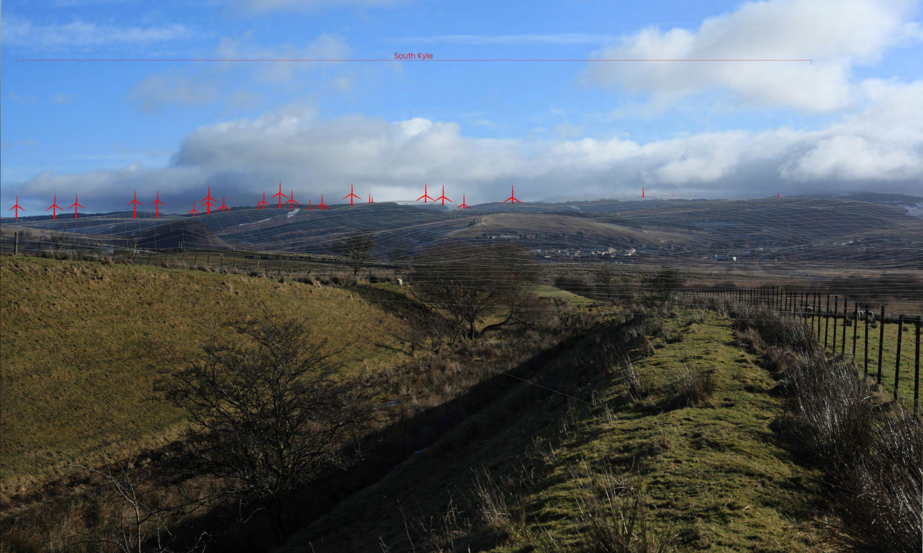
Increased turbine heights to 200m