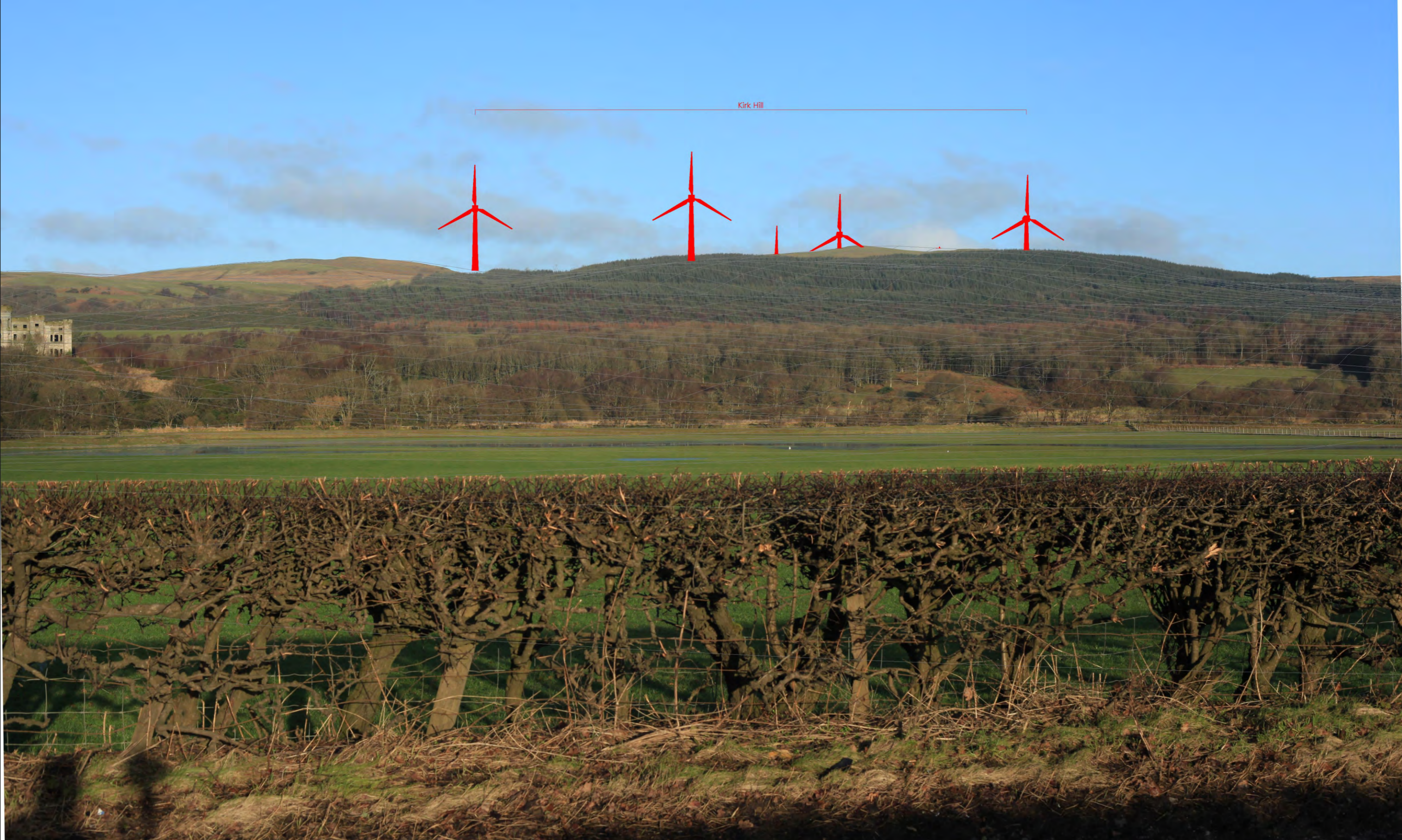
Increased turbine heights to 200m