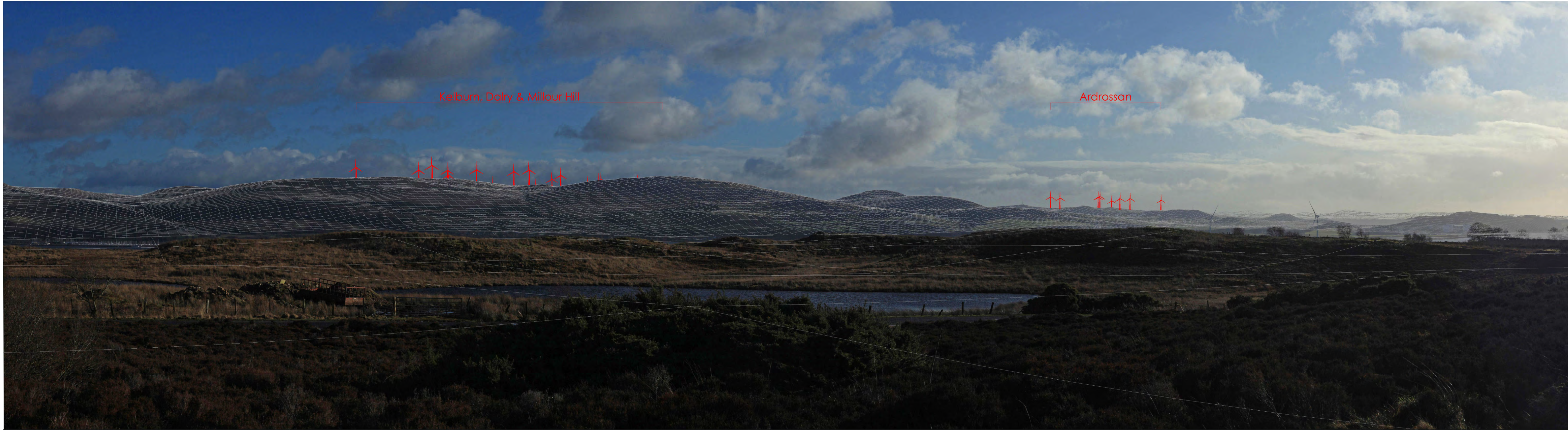
Increased turbine heights to 200m