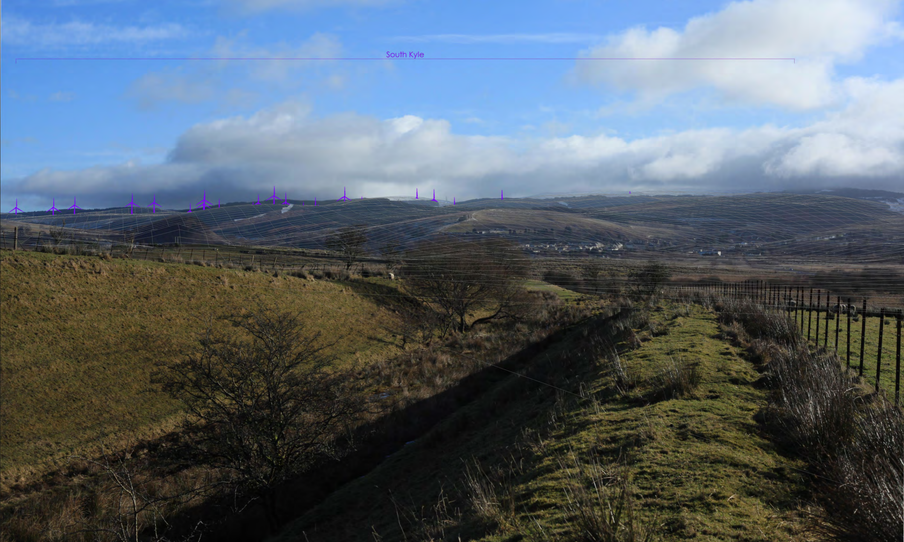
Increased turbine heights to 150m