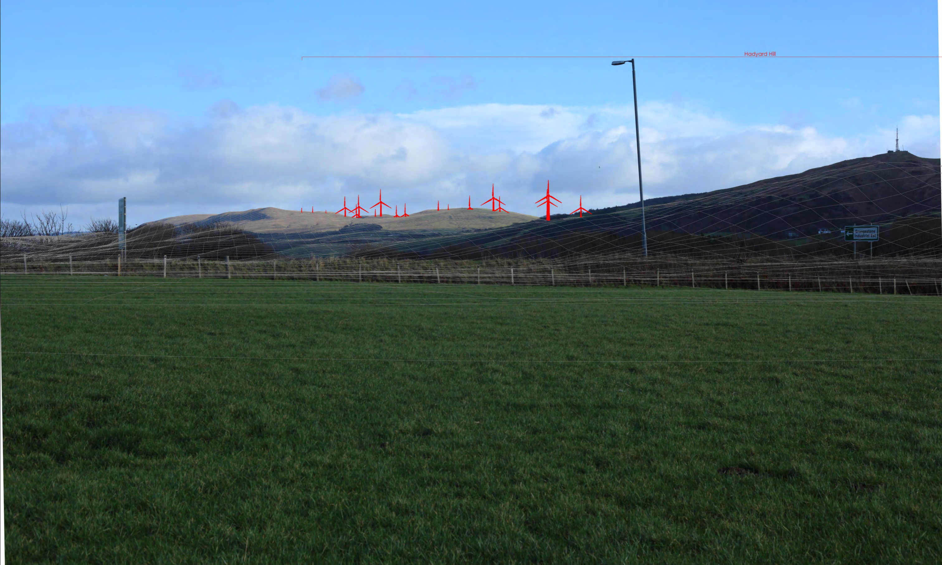
Increased turbine heights to 200m