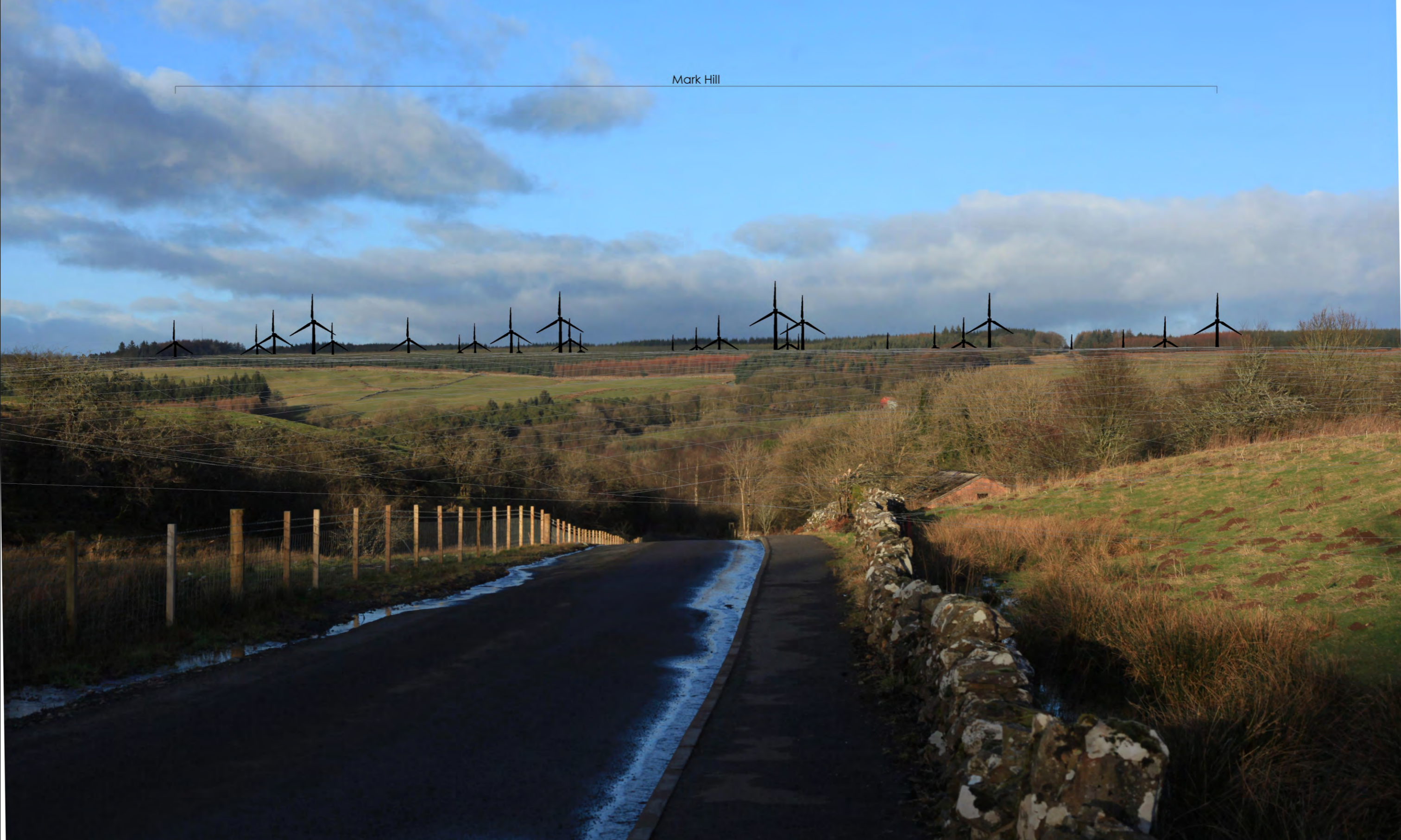
Original operational and consented turbine heights