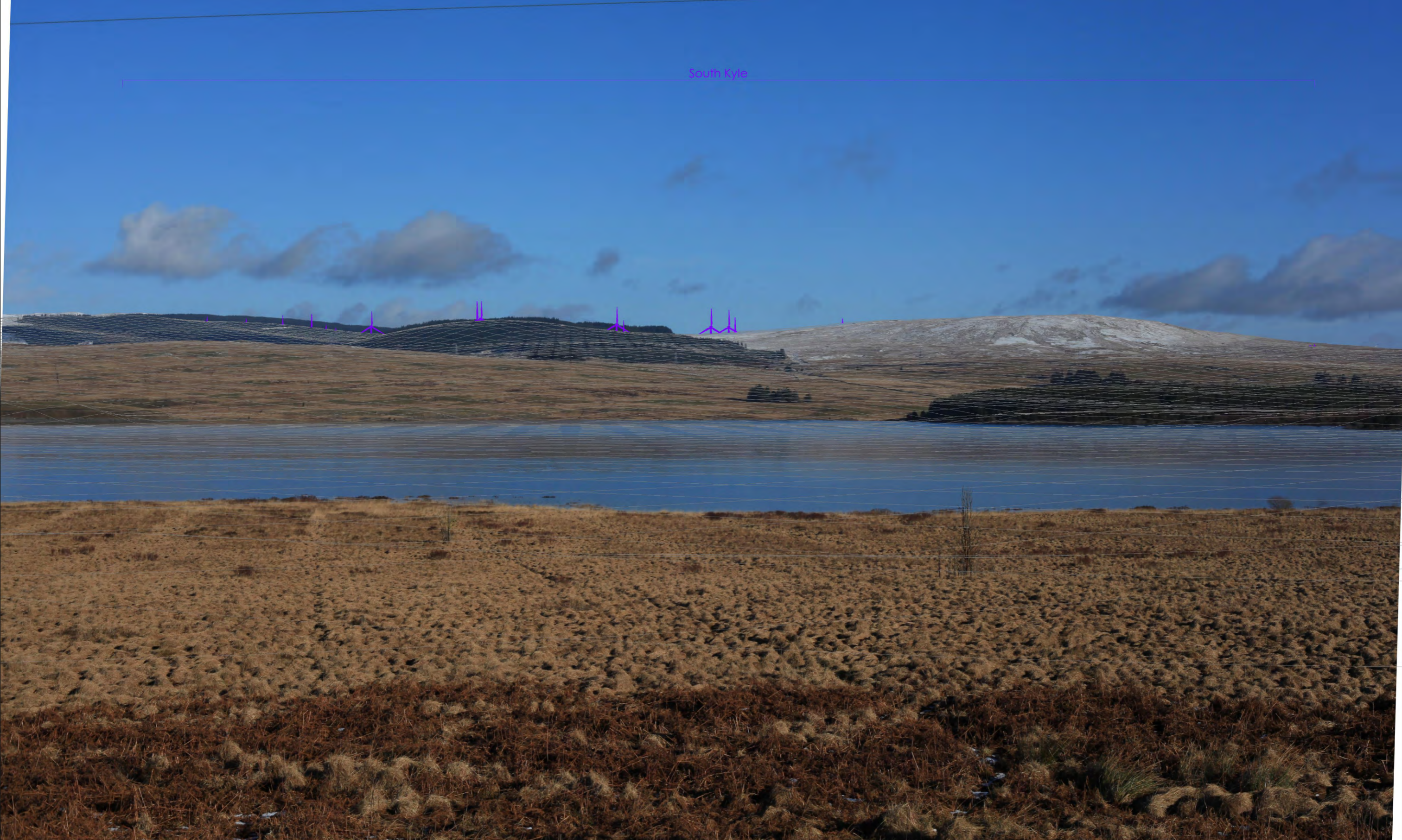
Increased turbine heights to 150m