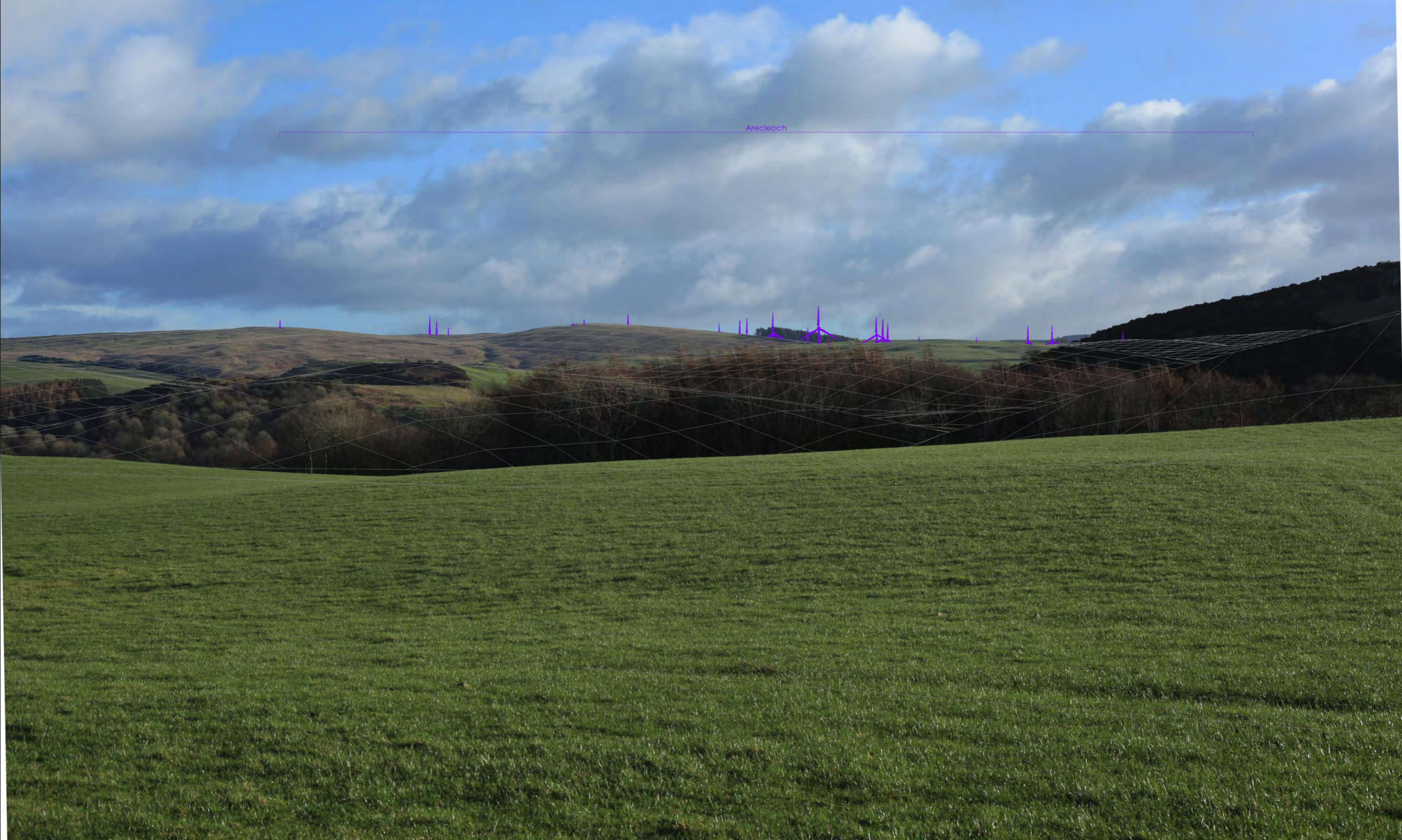
Increased turbine heights to 150m