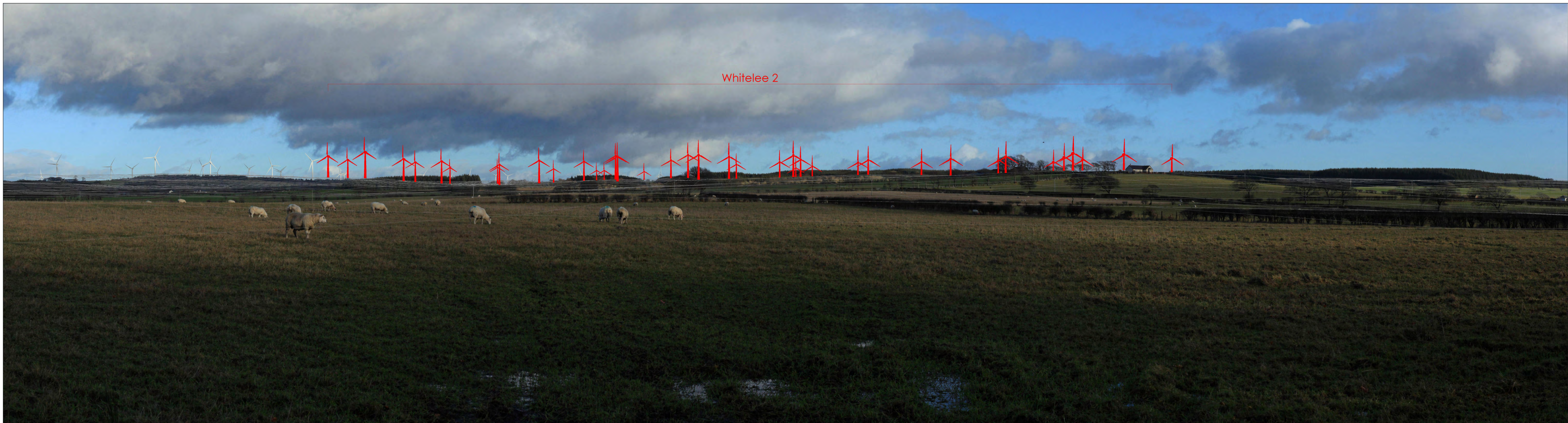
Increased turbine heights to 200m