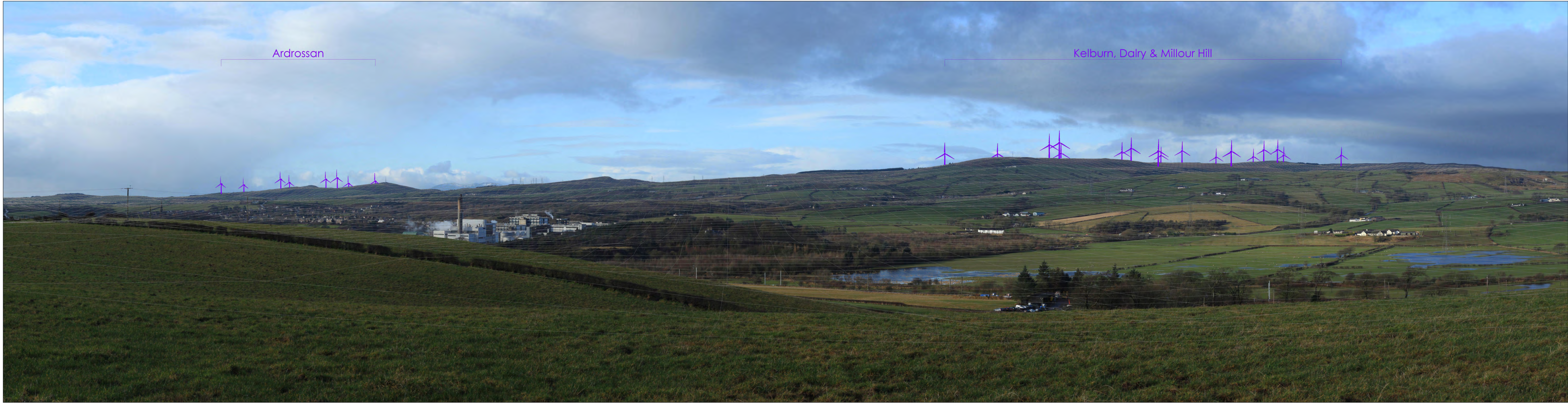
Increased turbine heights to 150m