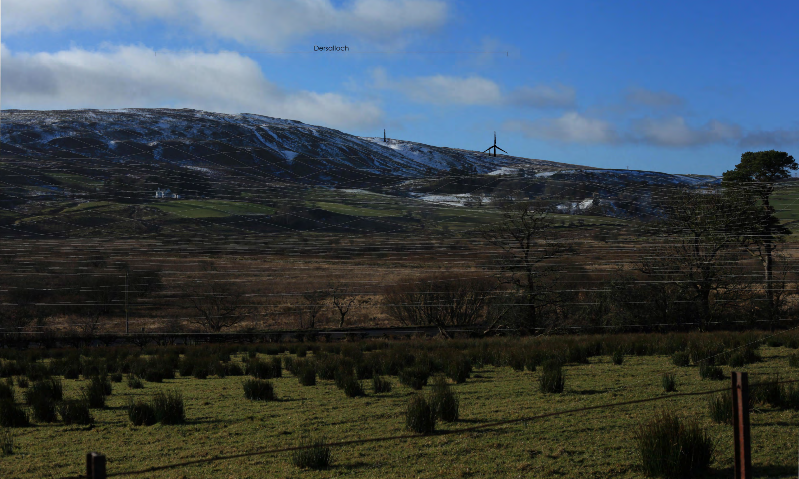
Original operational and consented turbine heights