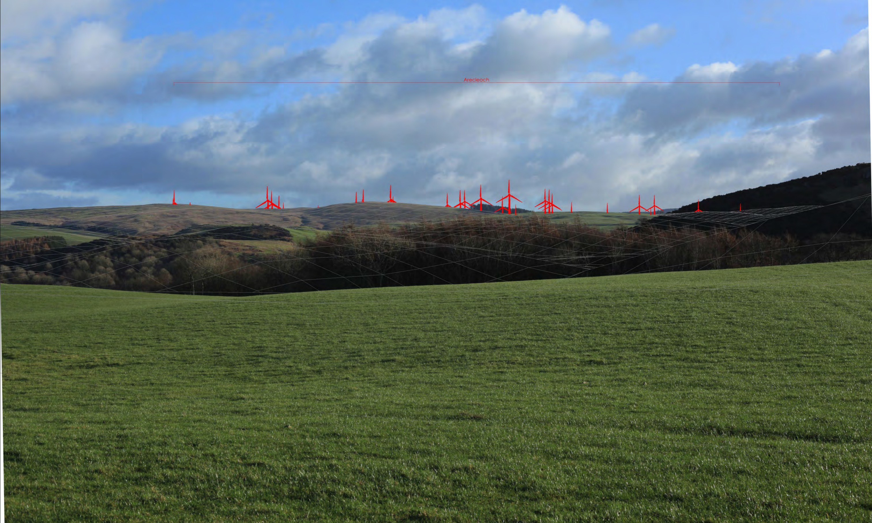
Increased turbine heights to 200m