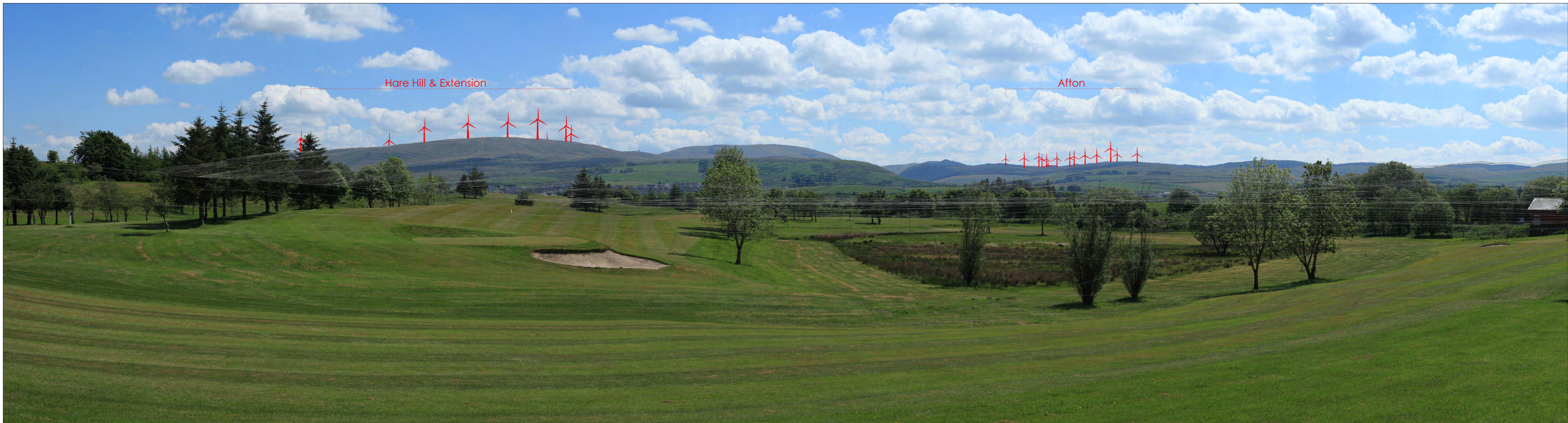
Increased turbine heights to 200m