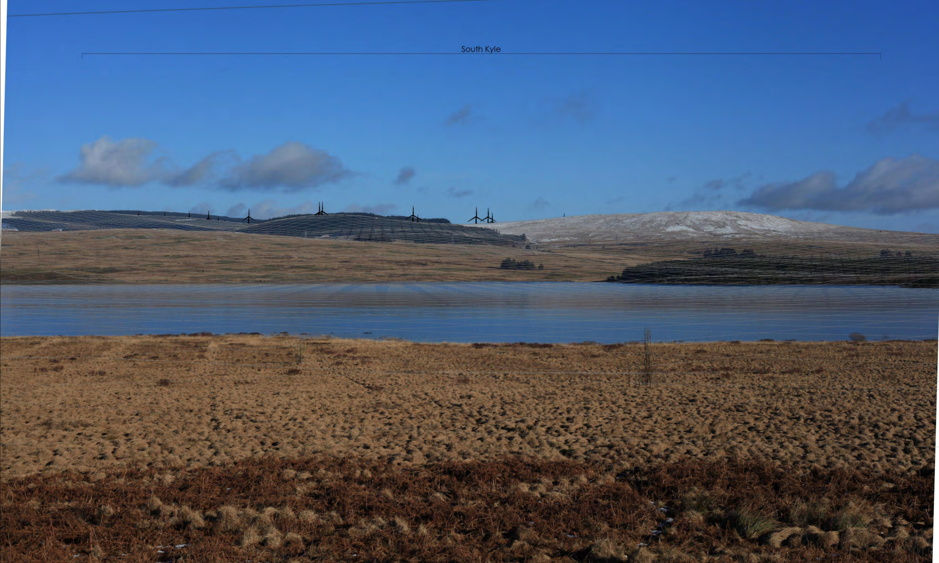
Original operational and consented turbine heights