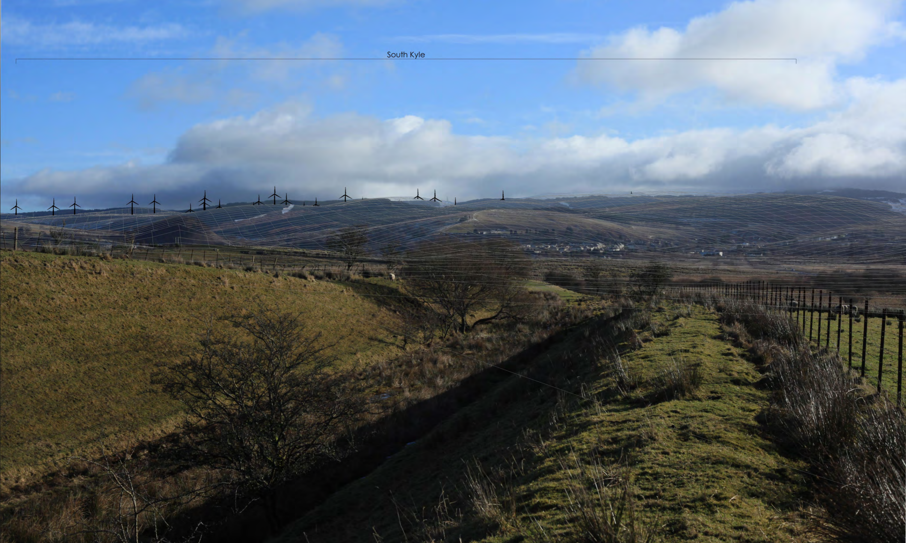
Original operational and consented turbine heights