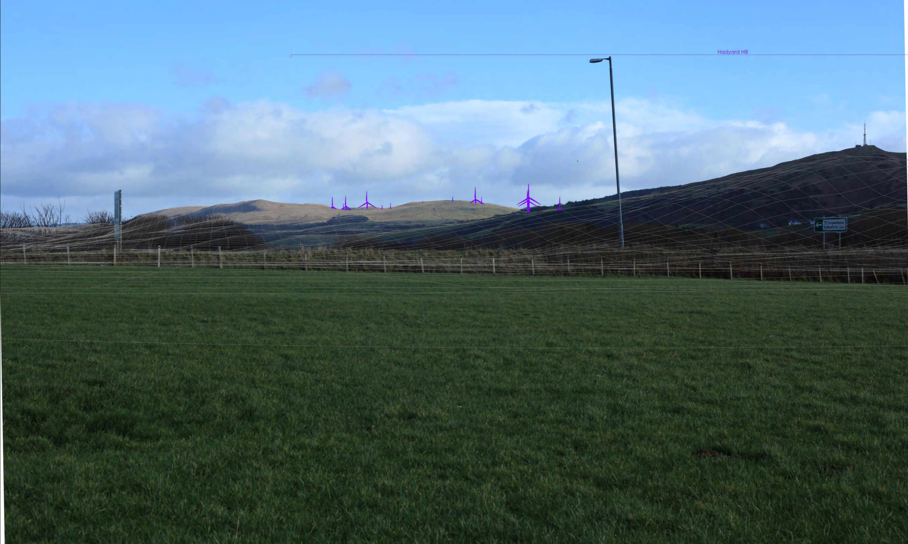
Increased turbine heights to 150m