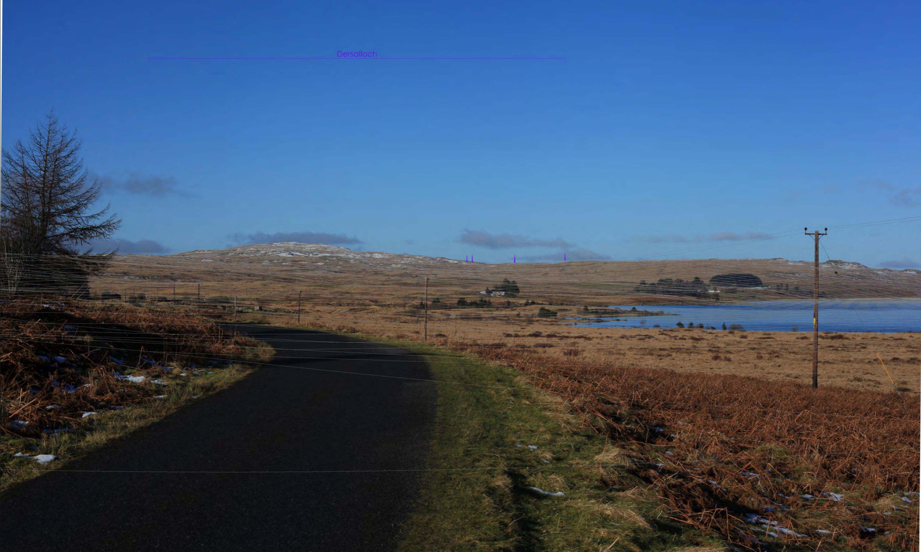
Increased turbine heights to 150m