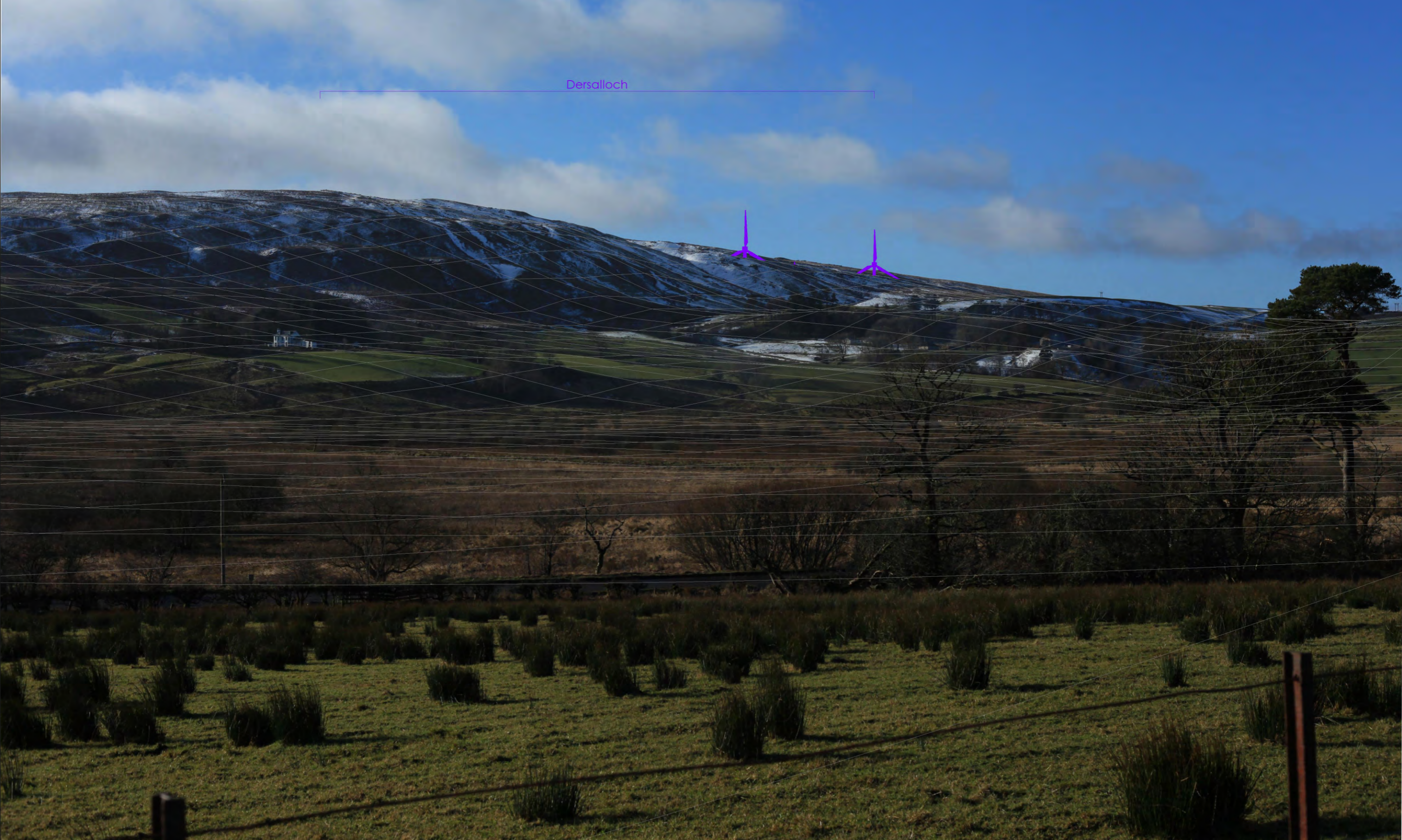
Increased turbine heights to 150m