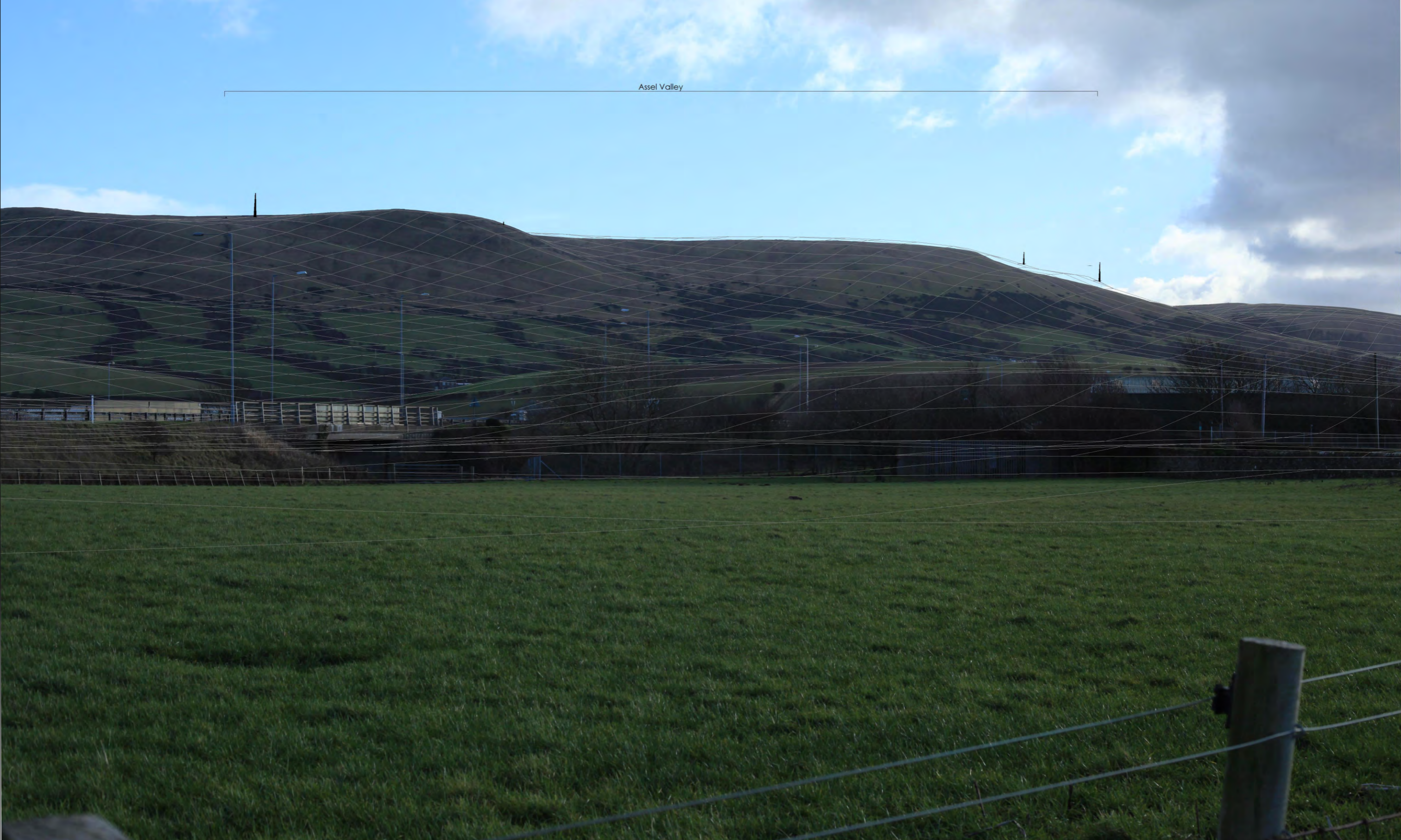
Original operational and consented turbine heights