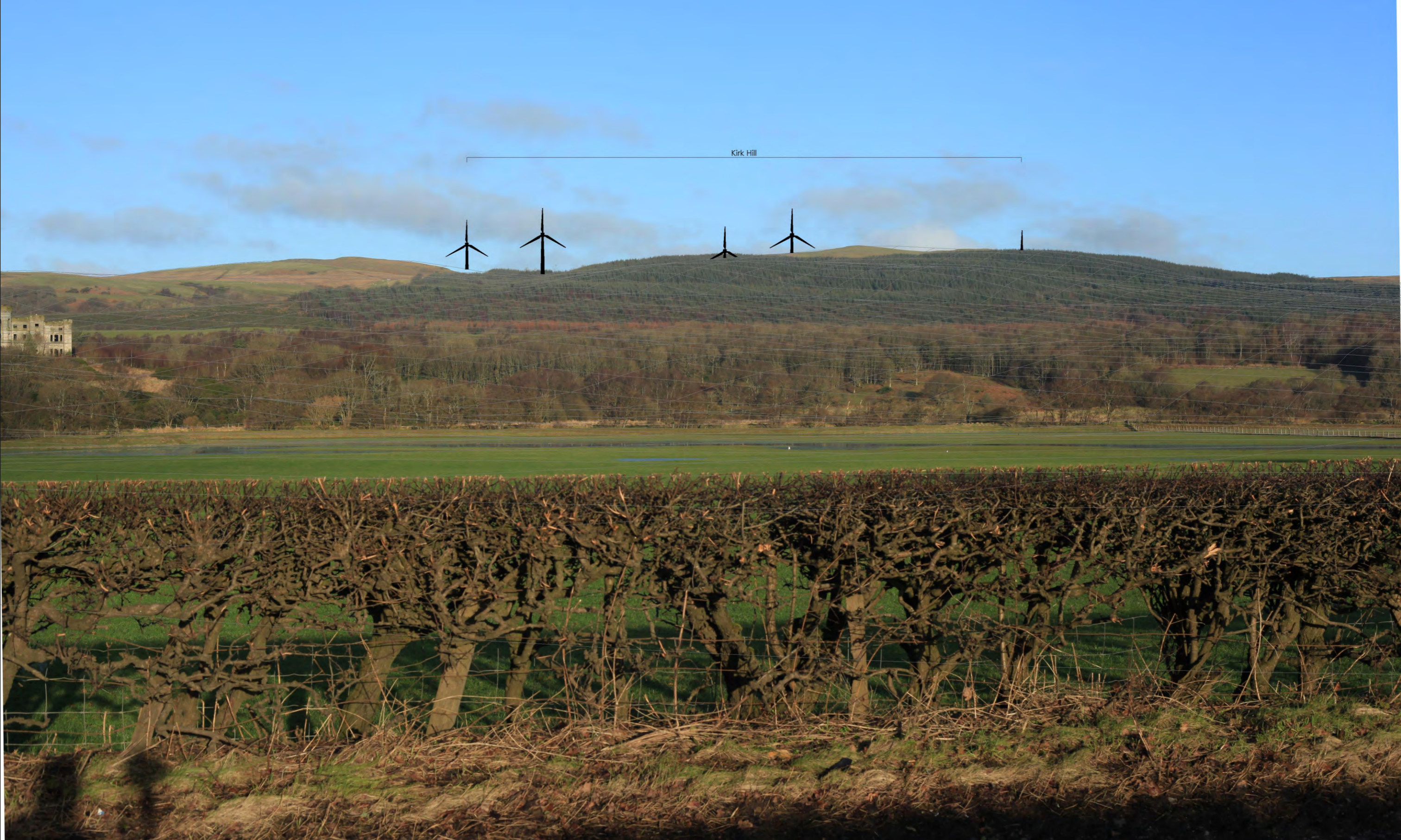
Original operational and consented turbine heights