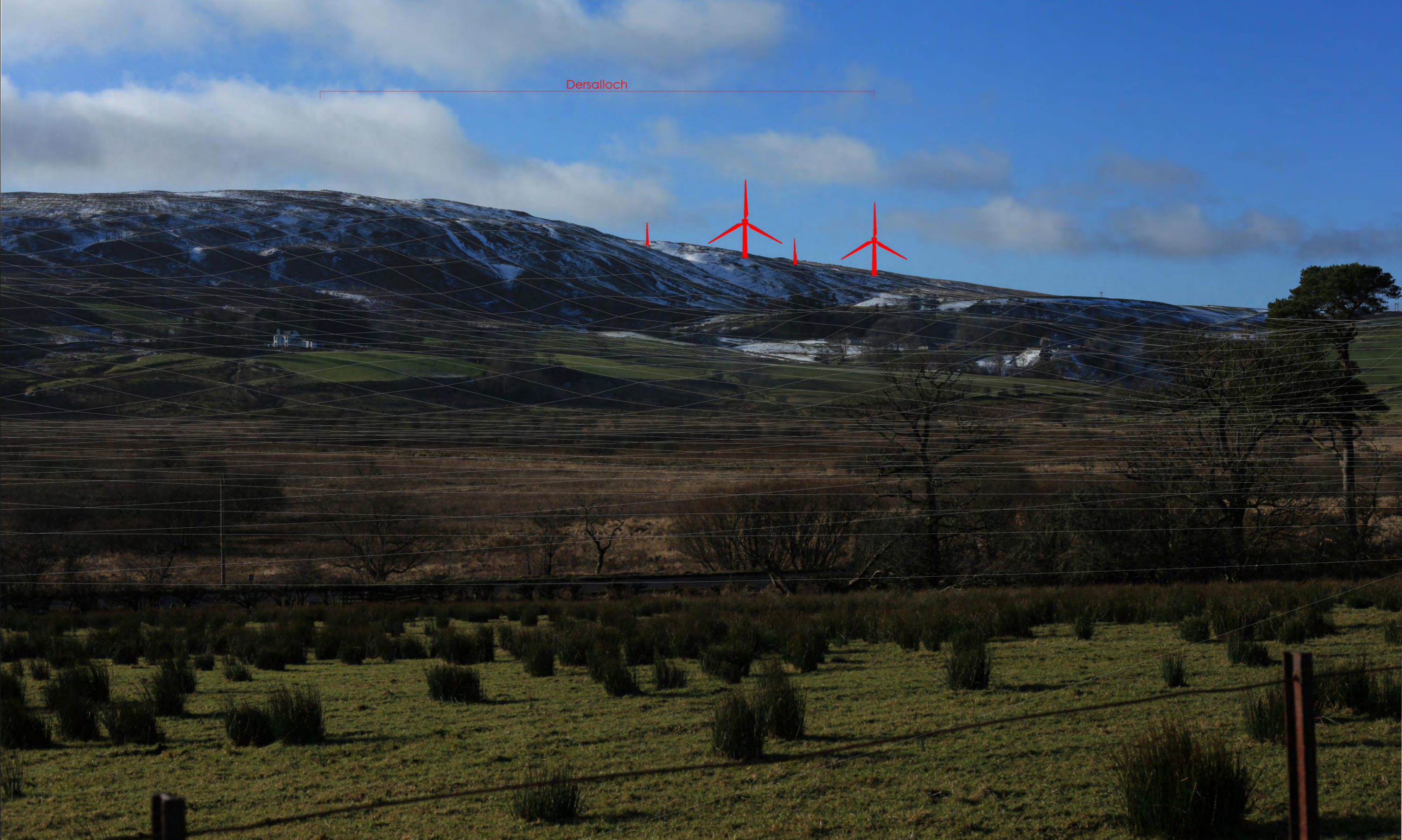
Increased turbine heights to 200m